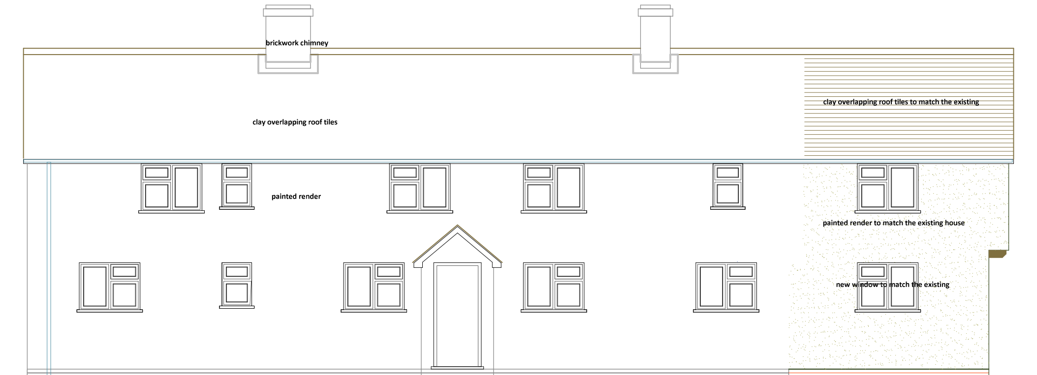
Proposed Rear Elevation : Rear [South]