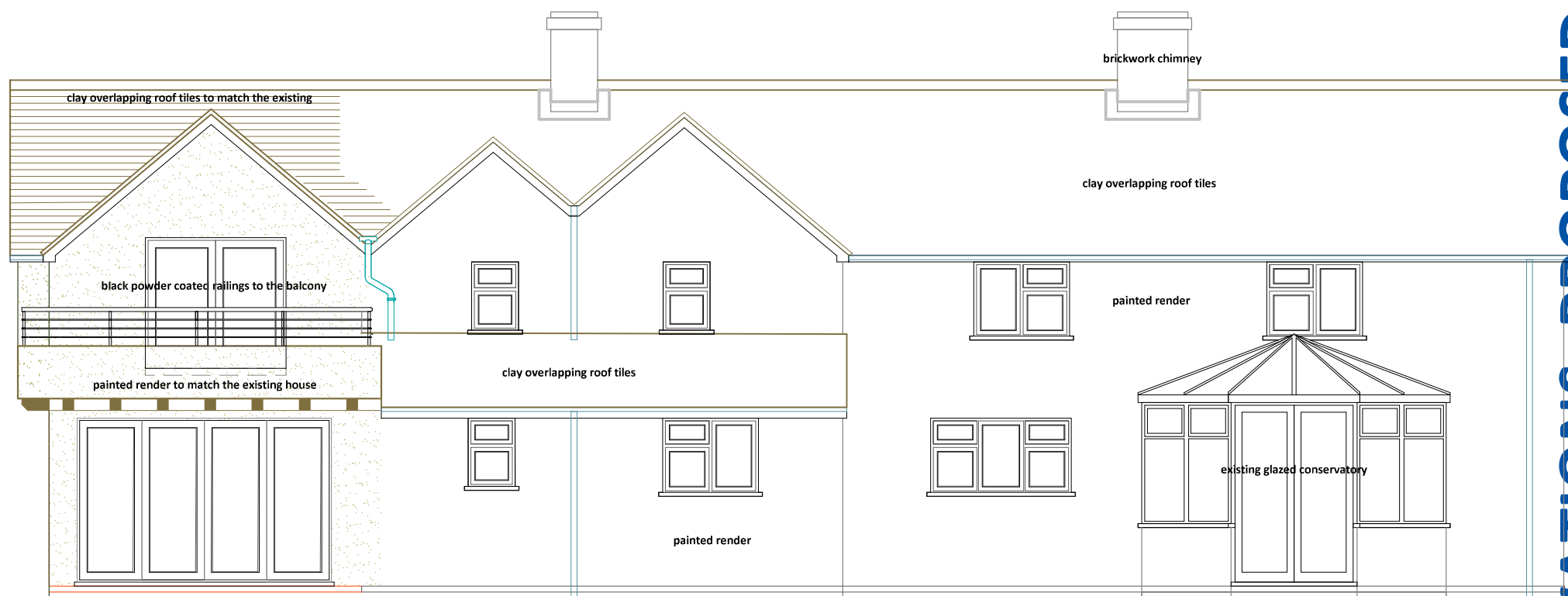
Proposed Front Elevation : Rear [North]