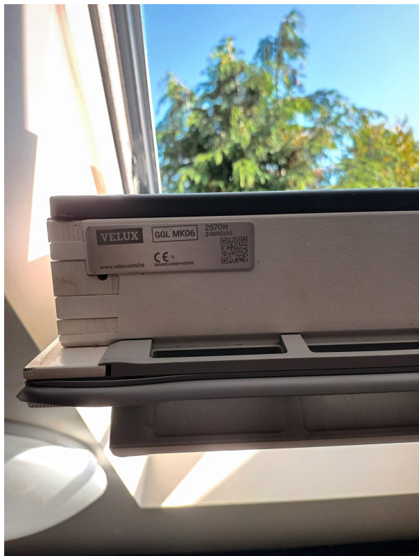
Vellux window manufacturer window code