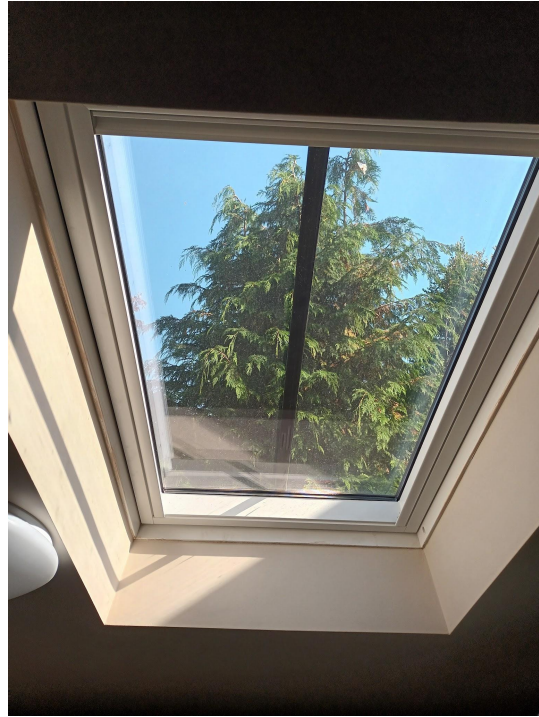
Internal photographs of the two windows in the single story of the building