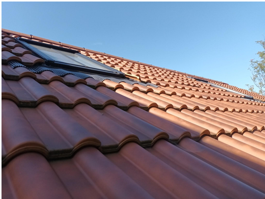
Rooflights on the single story

The client has installed three Vellux GGL MK06 recessed conservation windows with central glazing bars to the roof lights of the north elevation, see the attached photographic evidence. The windows have been inspected by Buildings Control.