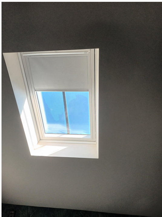
Internal photograph of the window on the double story.