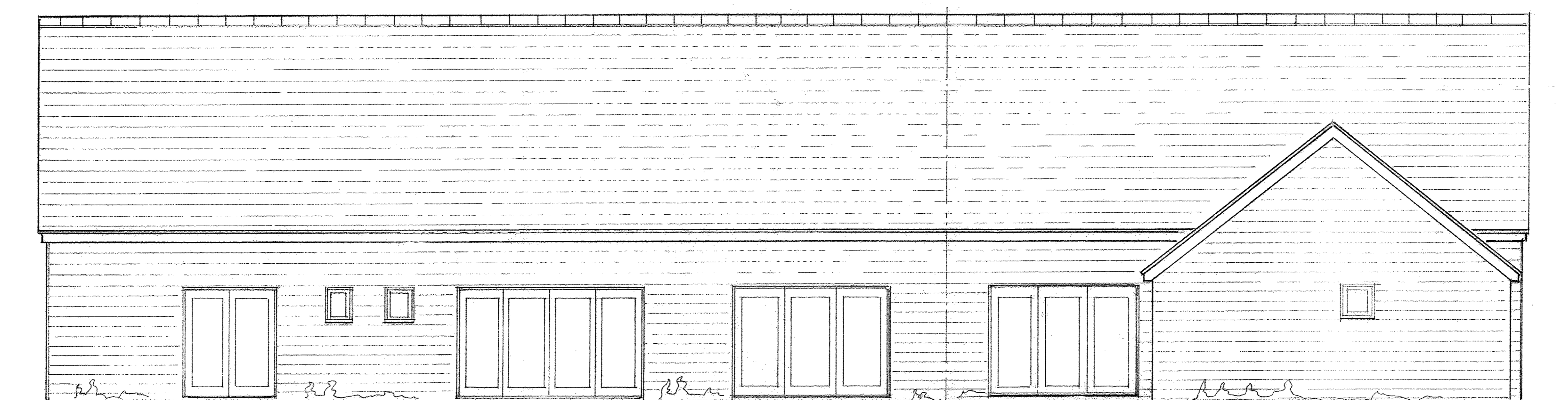
Existing Elevation Facing South West.