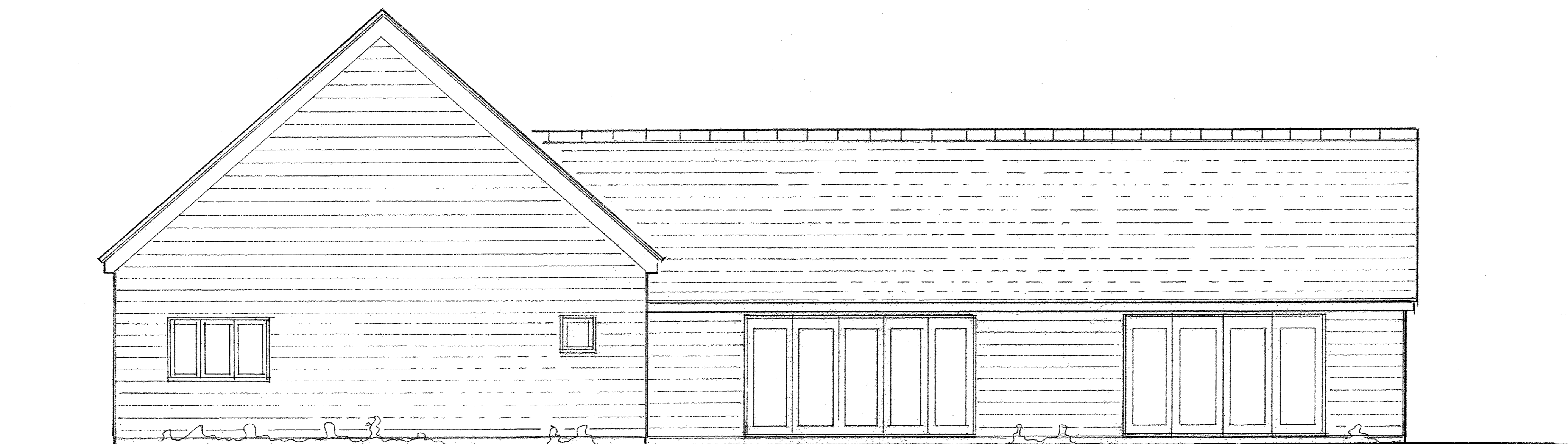
Existing Elevation Facing North West.