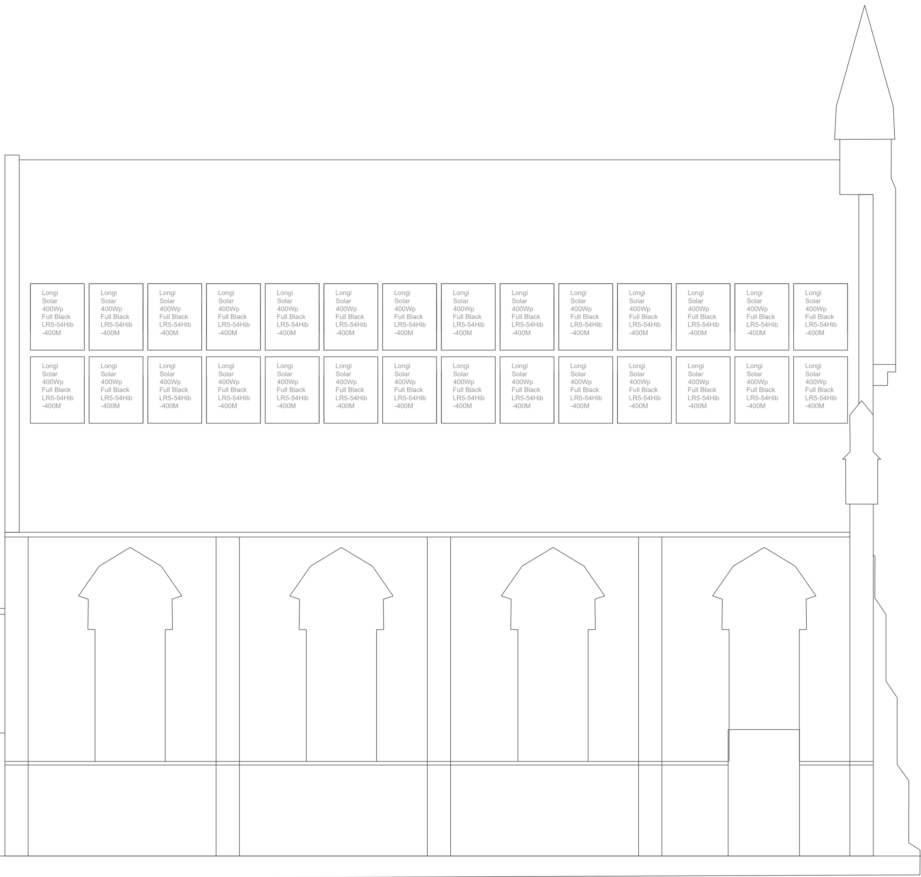
South Side Elevation

Community Infrastructure Levy Forms to be completed and confirmation received from council prior to commencement that all required information has been received. If these forms are not completed prior to commencement then the Levy will become due and no relief will be possible.