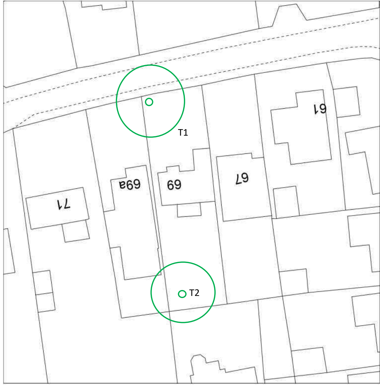
69, Renacres Lane, Halsall, Ormskirk