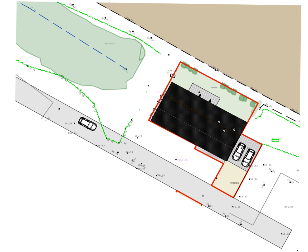
BLOCK PLAN 1:500 scale