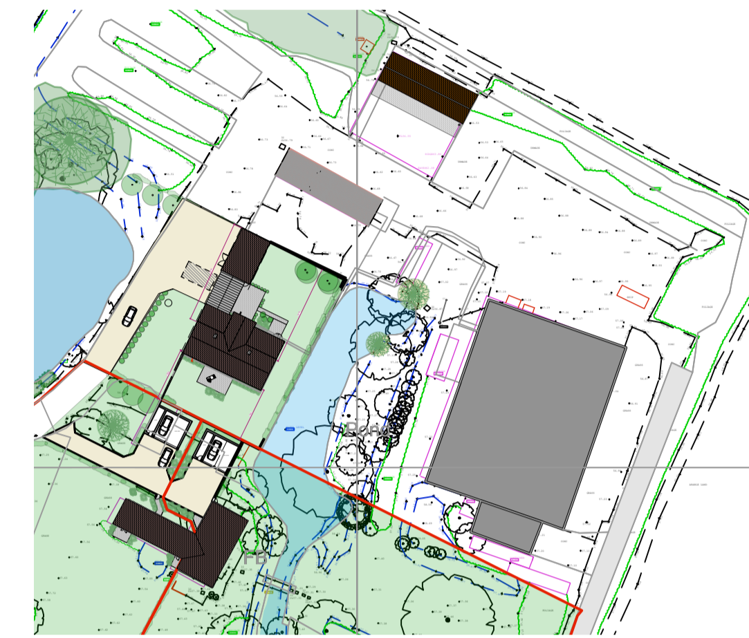
BLOCK PLAN 1:1000 scale