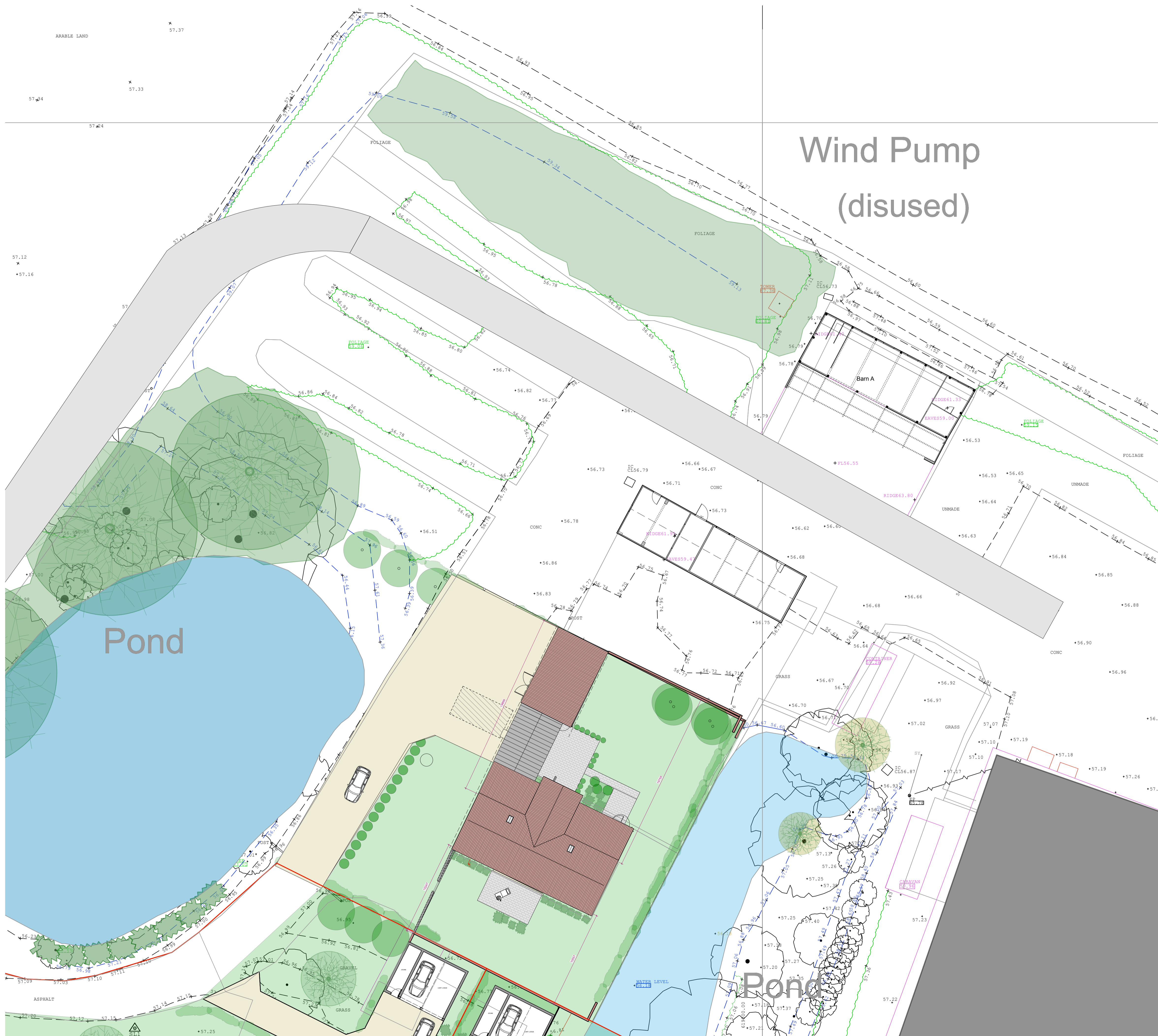
SITE PLAN 1:200 scale

General Notes 1. Do not scale this drawing. All dimensions to be as noted. Contractor to check all dimensions on site before carry out works. 2. This drawing is for the private and confidential use of the client for whom it was undertaken and it should not be reproduced in whole or in part or relied upon by third parties for any use without the express written authority of Beech Architects Limited.