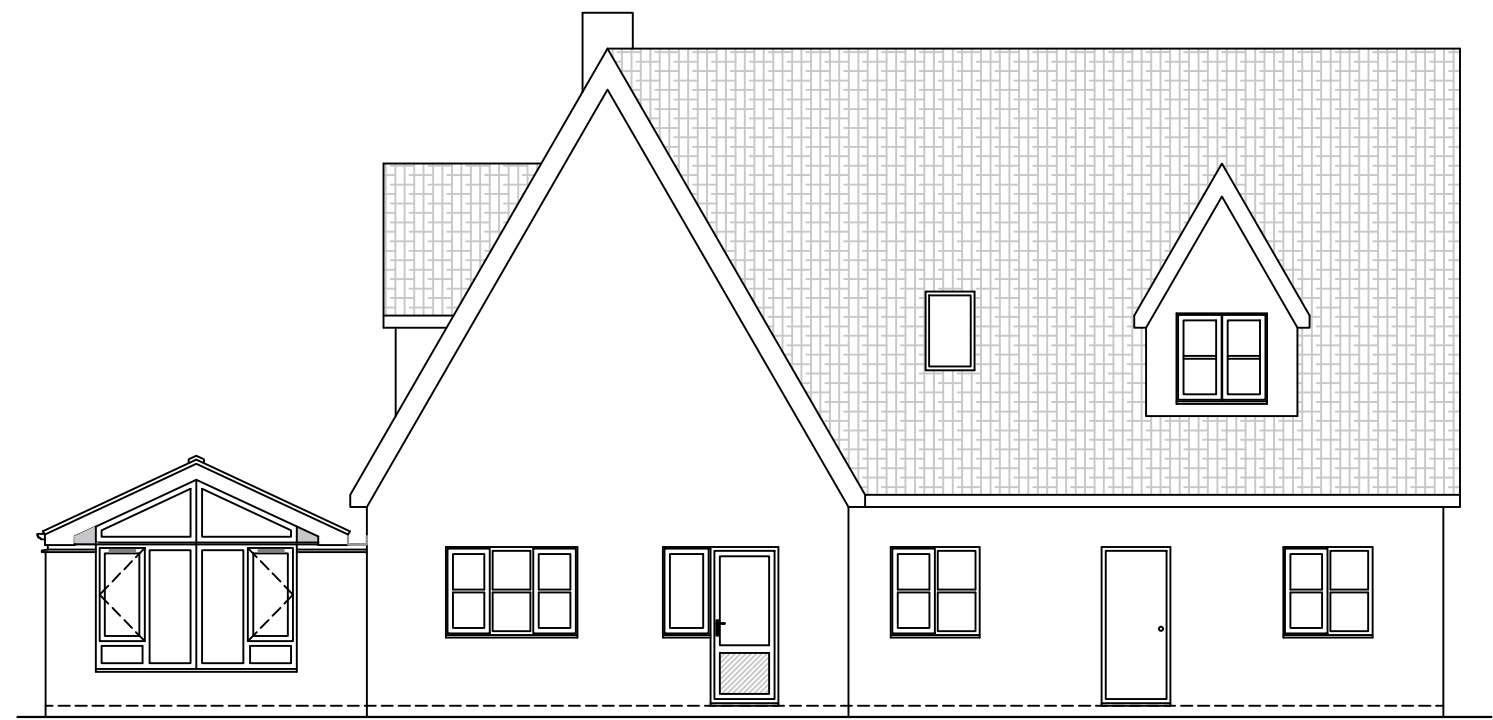
RIGHT-HAND SIDE ELEVATION

Notes: These drawings are the property of Anglian Home Improvements and must not be used, distributed, loaned or copied without the express permission of Anglian Home Improvements. All dimensions are in millimetres (mm) unless noted otherwise. Do not use for base laying purposes