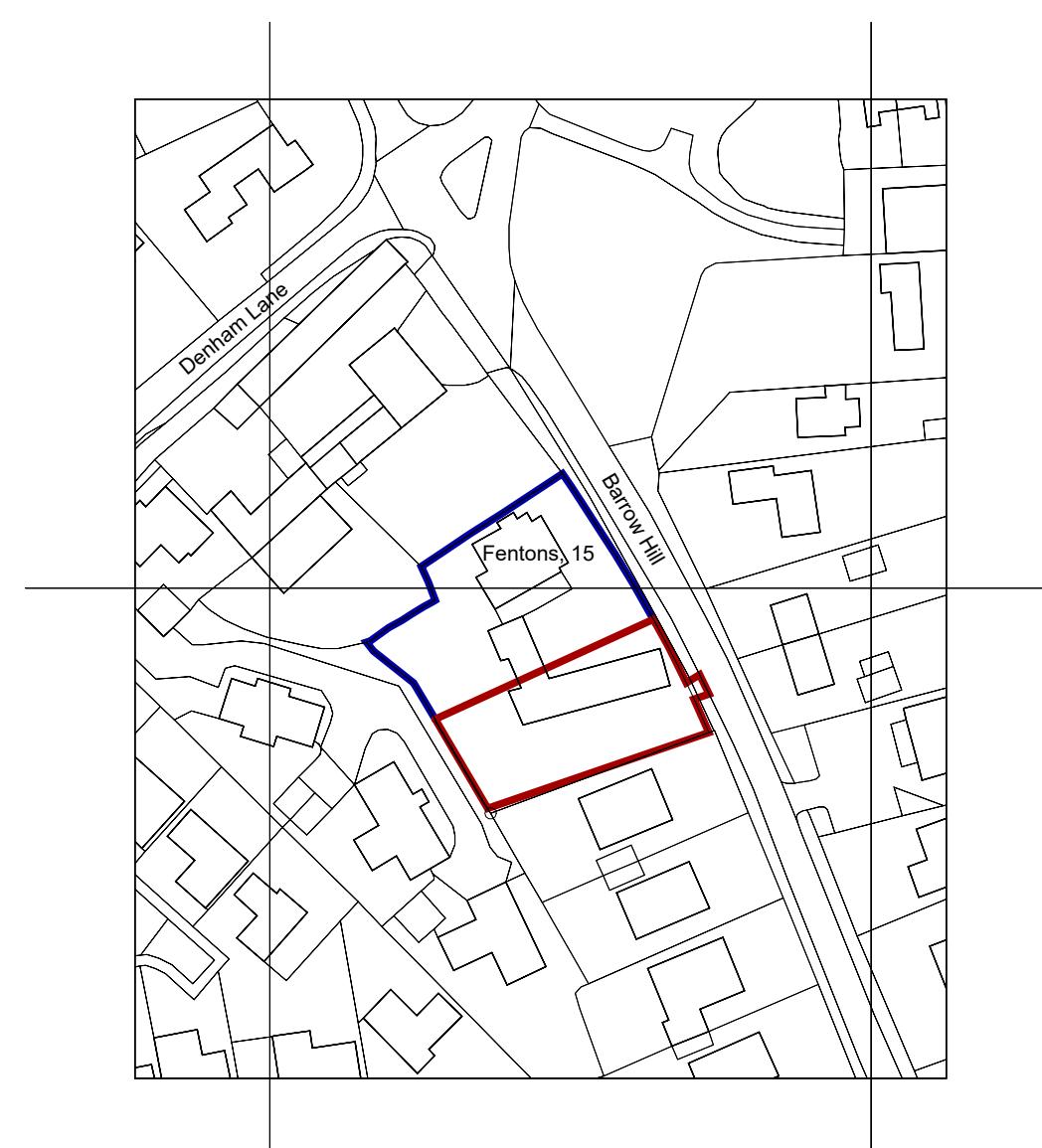
2 Location Plan 1 : 1250