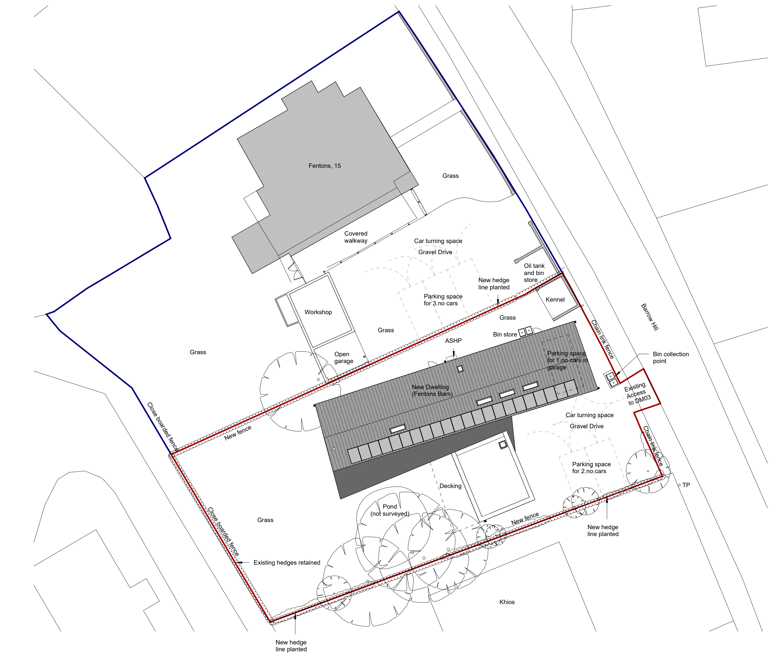
3 Proposed Block Plan 1 : 200