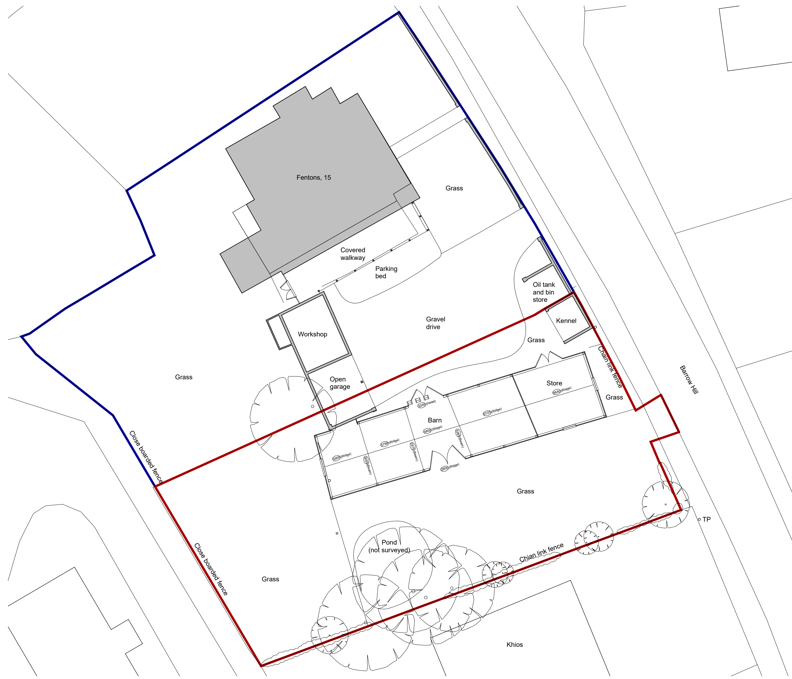
1 Existing Block Plan 1 : 200