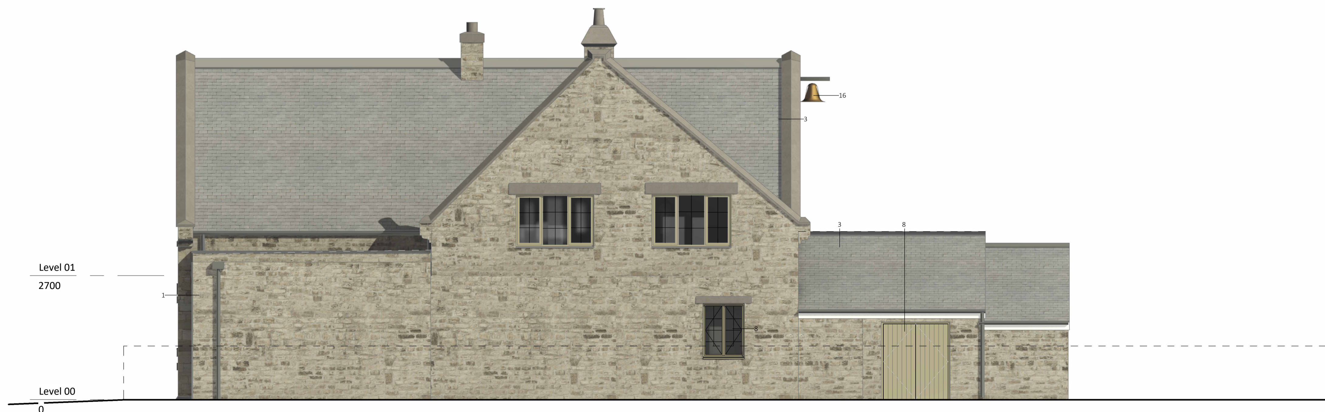
Proposed East Elevation 1 : 50