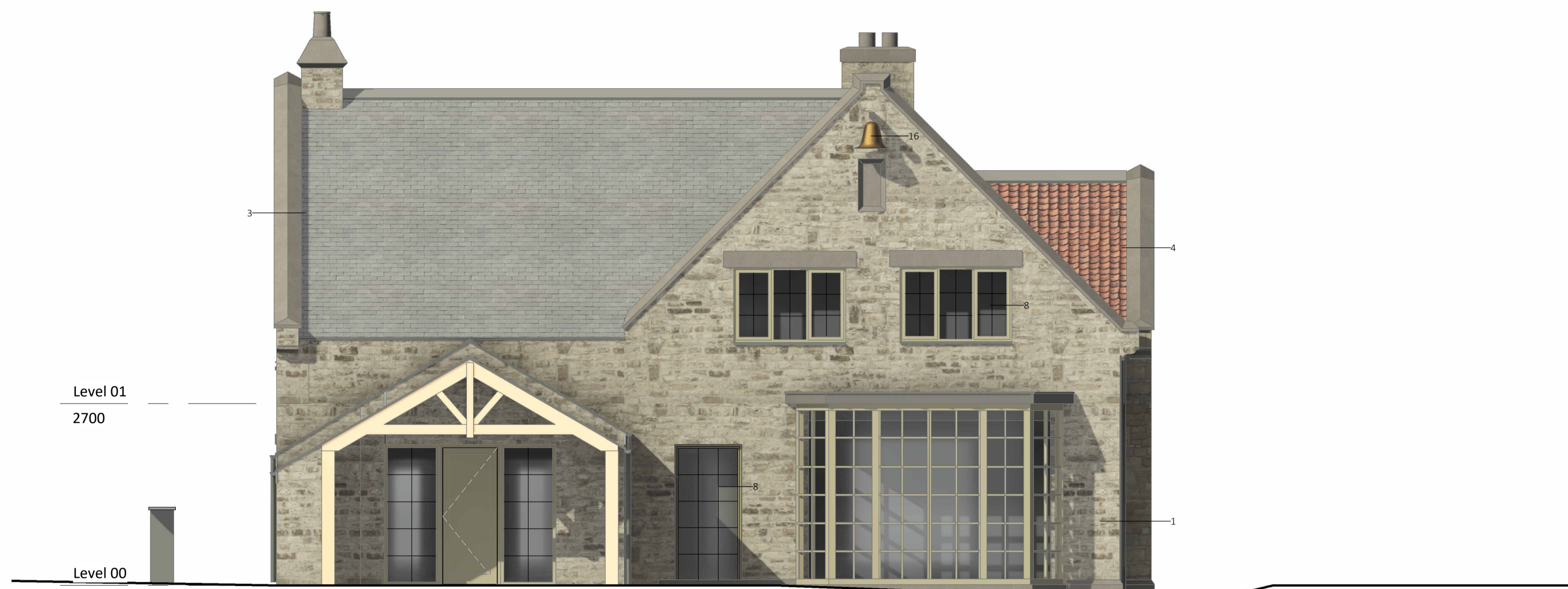
Proposed North Elevation 1 : 50