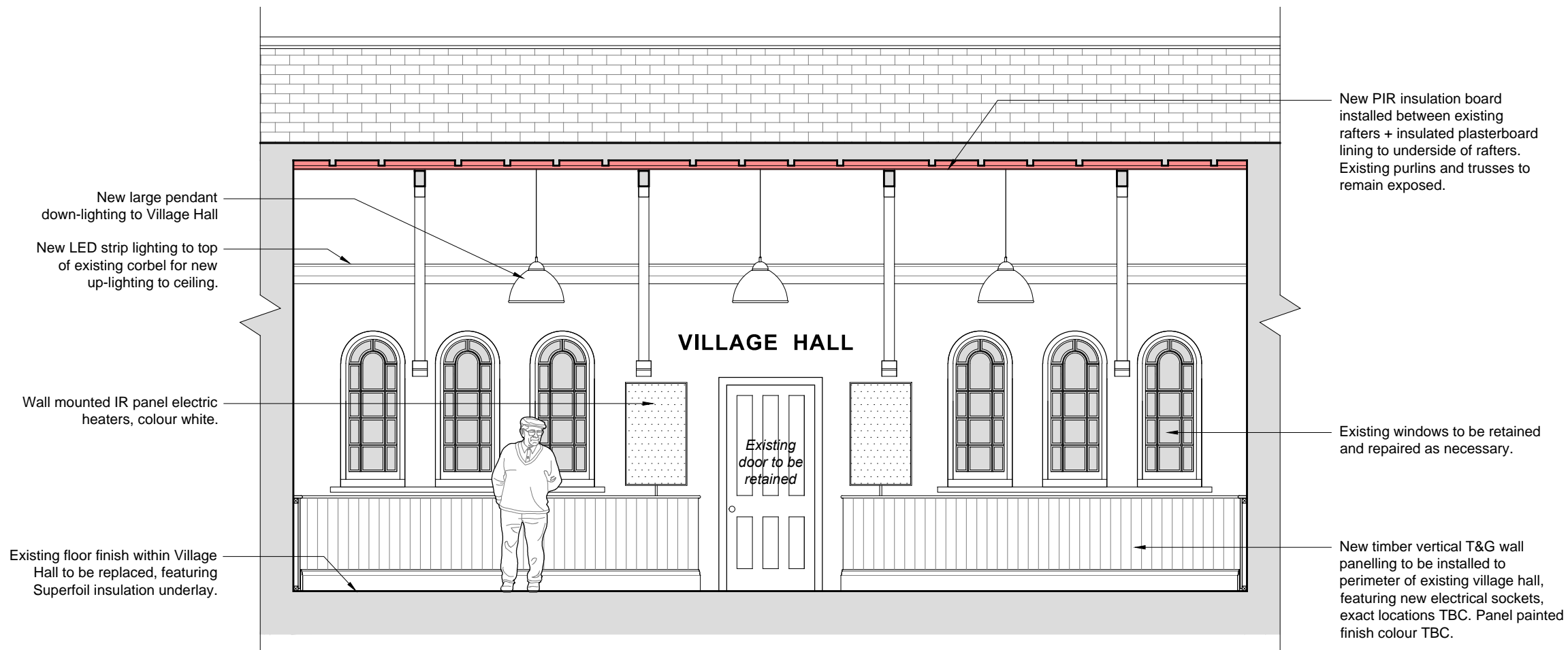
PROPOSED INTERNAL ELEVATION 2 (Facing South) 1:50 @ A3