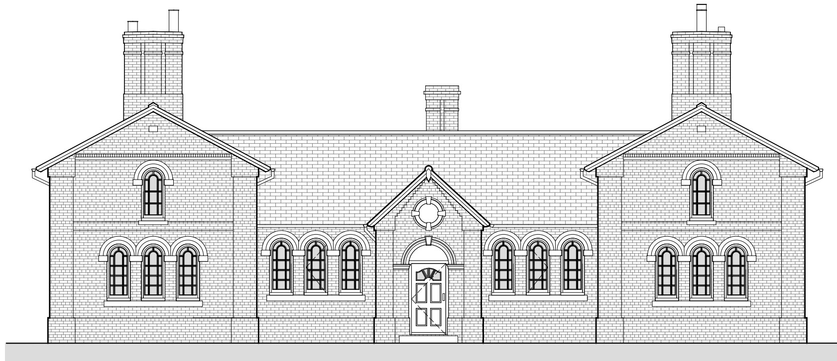
EXISTING ELEVATION A (Front)