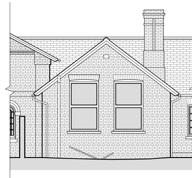
EXISTING ELEVATION B (Rear)