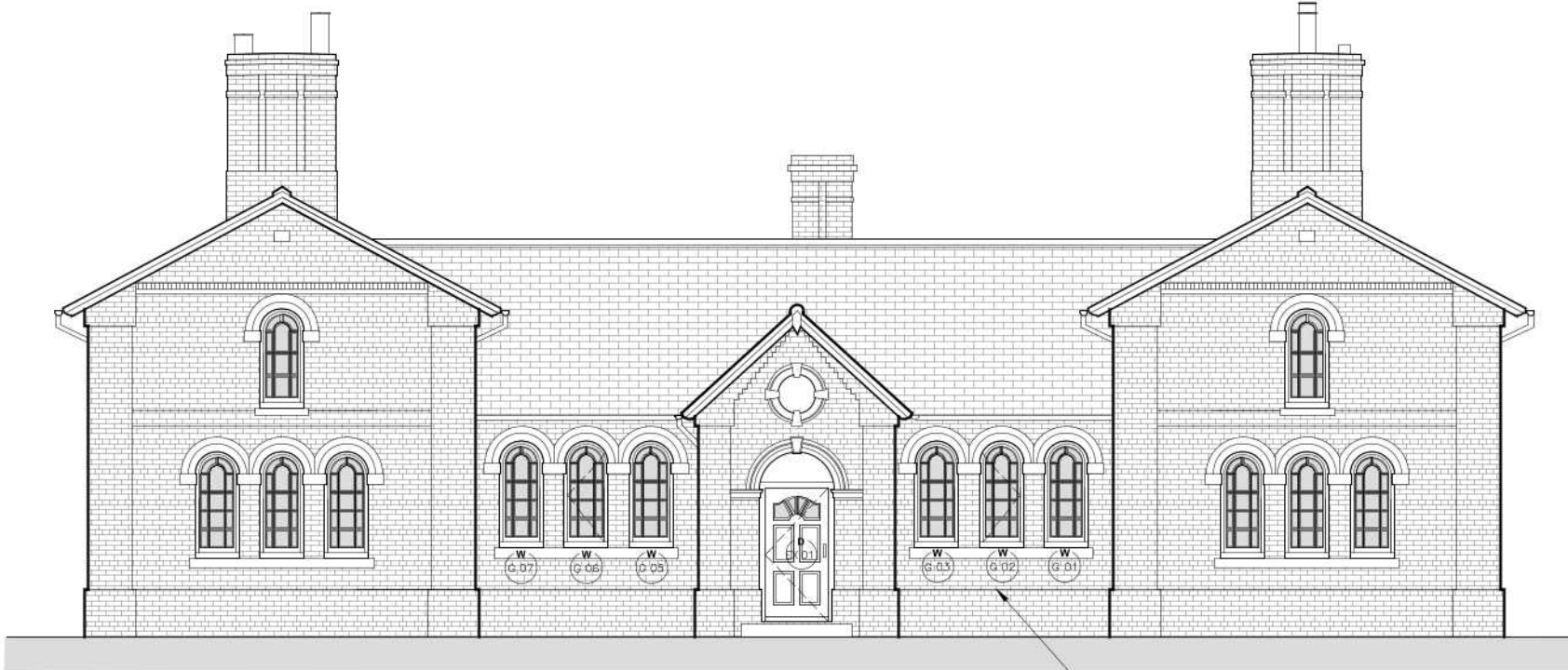
PROPOSED ELEVATION C (SOUTH) 1:100 @ A3