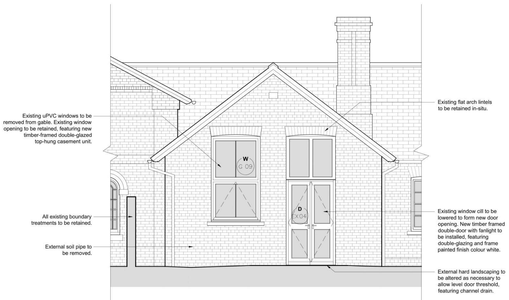
PROPOSED ELEVATION A (NORTH) 1:50 @ A3