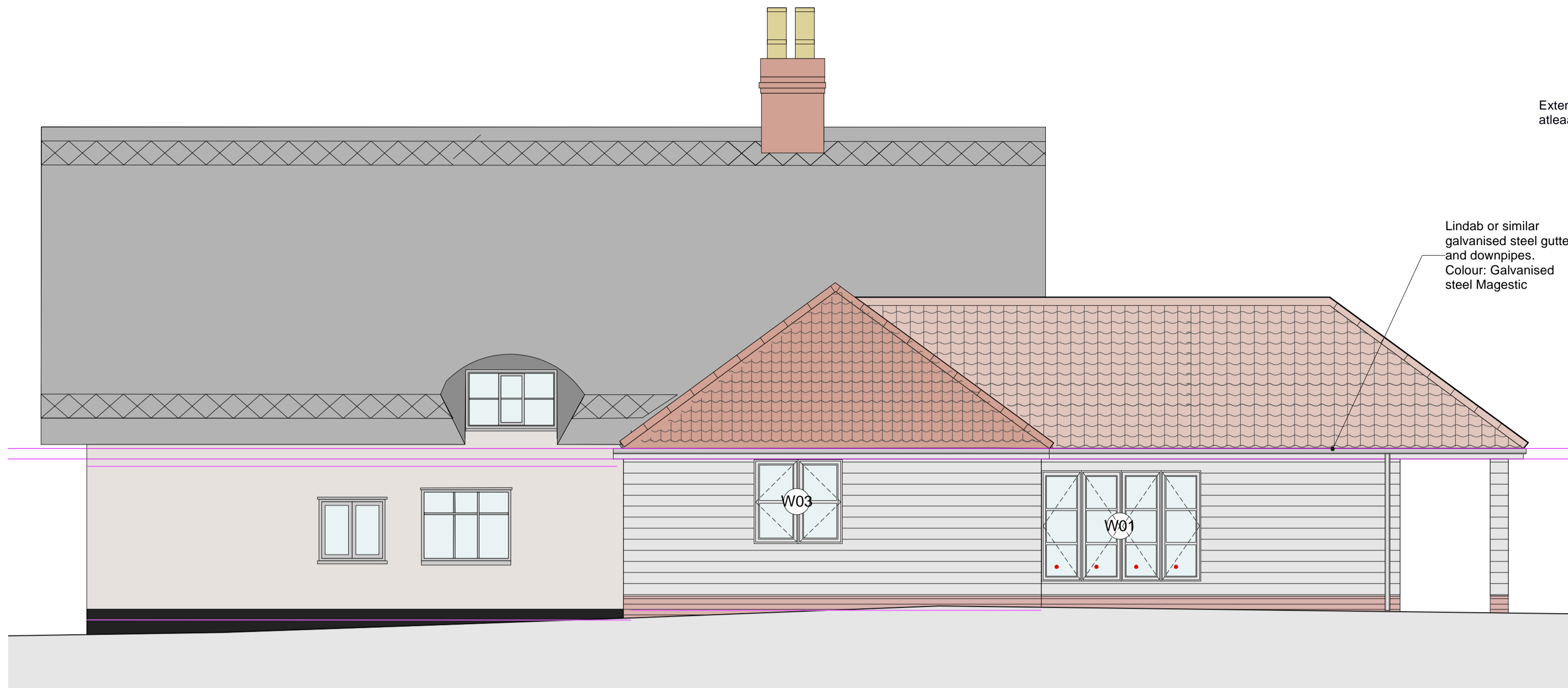
A - NORTH ELEVATION