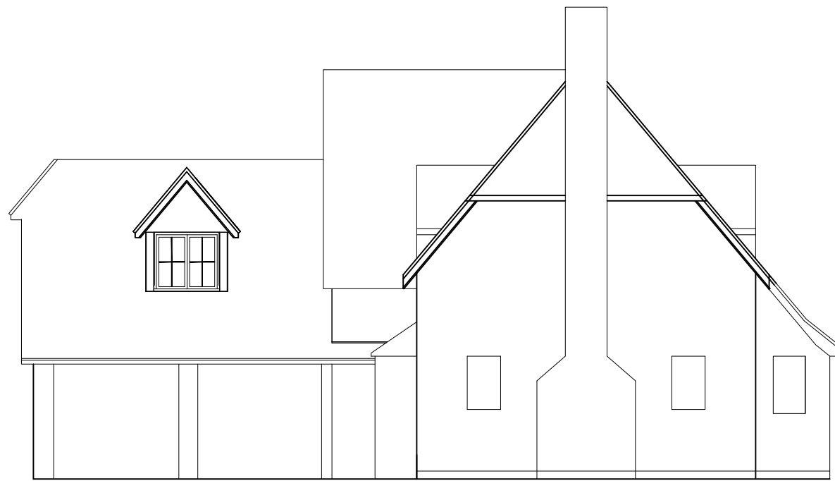
Existing side elevation (west)