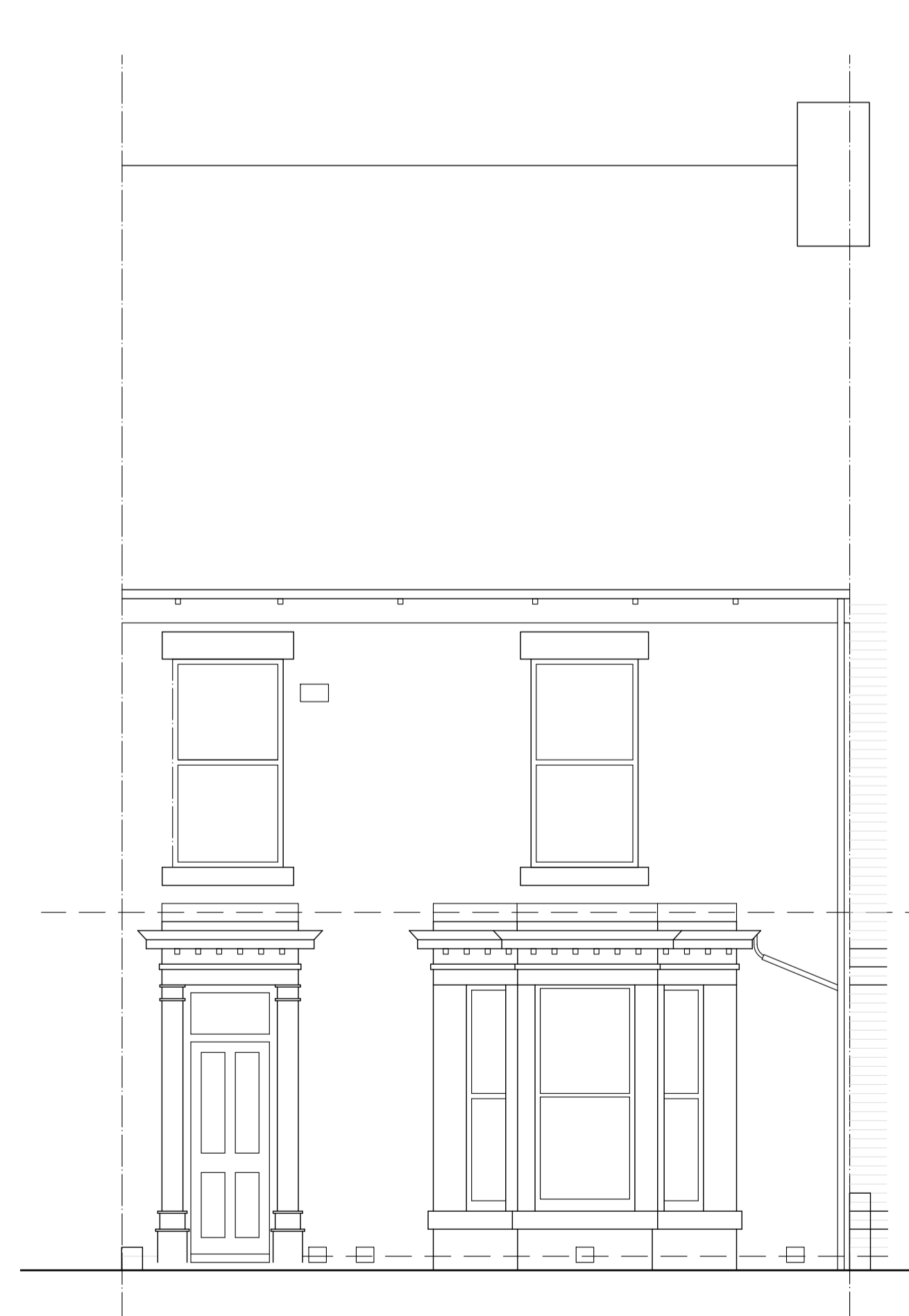
Front Elevation (Stanley Street)