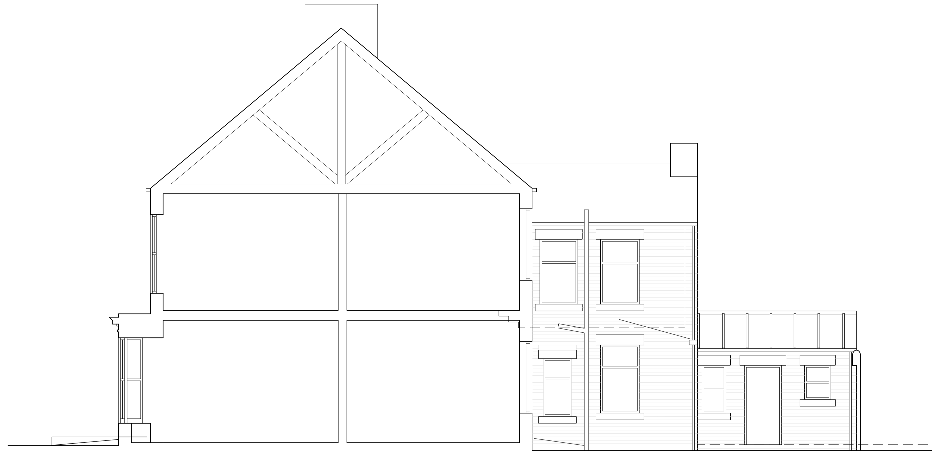
Side Elevation / Section

The use of this data by the recipient acts as an agreement of the following statements. Do not use this data if you do not agree. All features are approximate and subject to clarification by a detailed topographical survey, statutory service enquiries and confirmation of the legal boundaries. Do not scale the drawing. Use figured dimensions in all cases. Check all dimensions on site. Report any discrepancies in writing before proceeding.