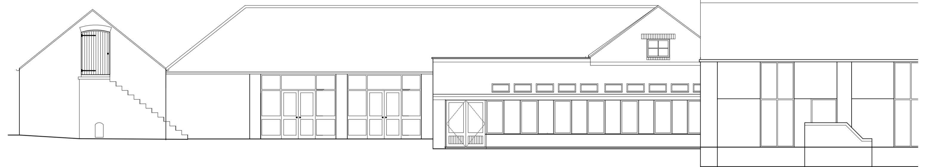
EXISTING SOUTH ELEVATION BB (COURT YARD) SCALE: 1:100