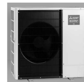
Mitsubishi Ecodan R32 8.5kw heat pump (x 2)