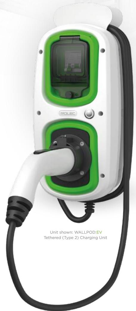
Unit shown: WALLPOD:EV Tethered (Type 2) Charging Unit

The WALLPOD:EV is a low-cost, entry level charging unit, designed to offer full Mode 3 fast charging to every Electric Vehicle (EV/PHEV) on the market today.