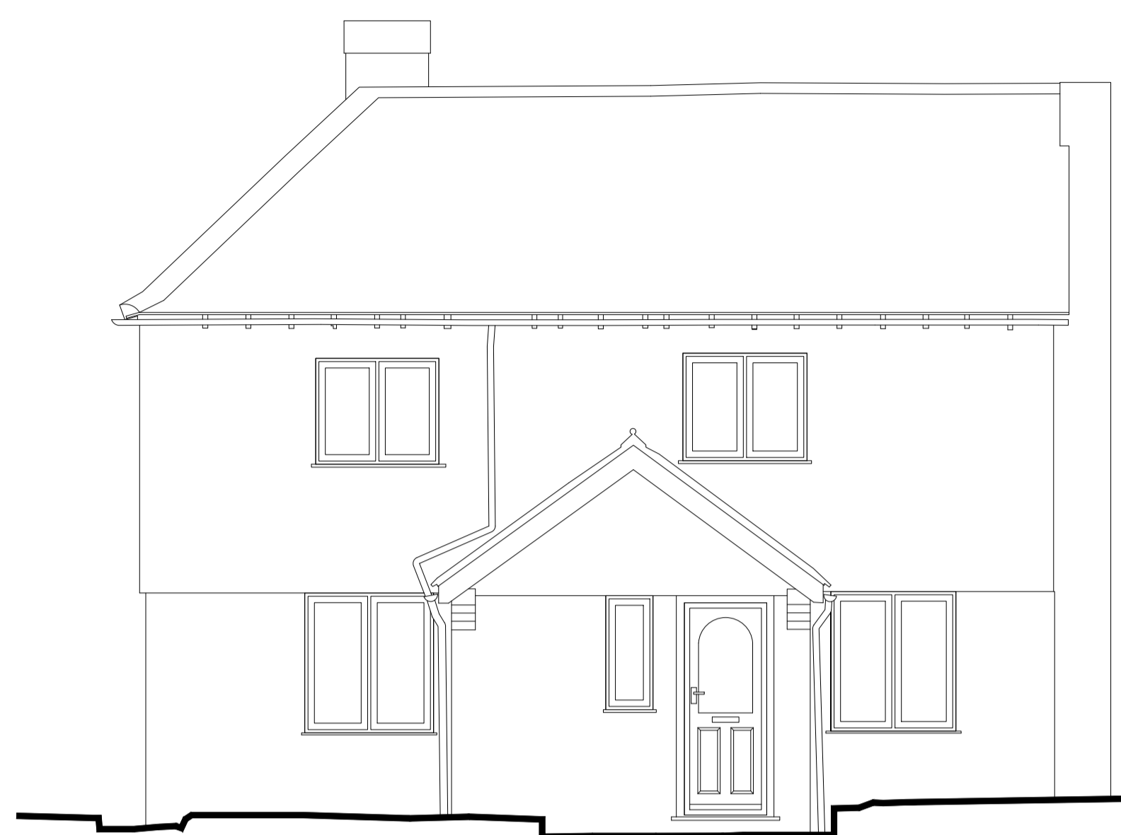
Front (South) Elevation

All dimensions are to be checked on site.