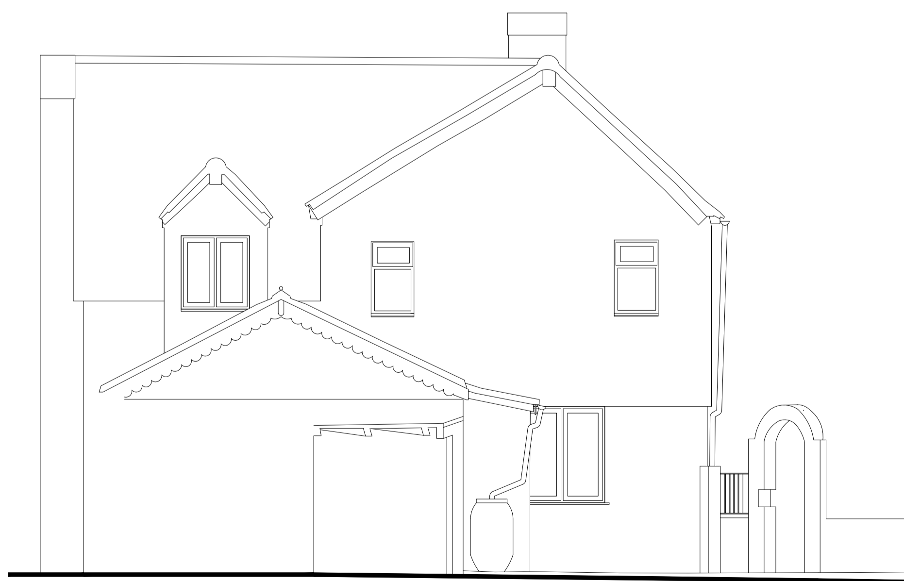
Rear (North) Elevation