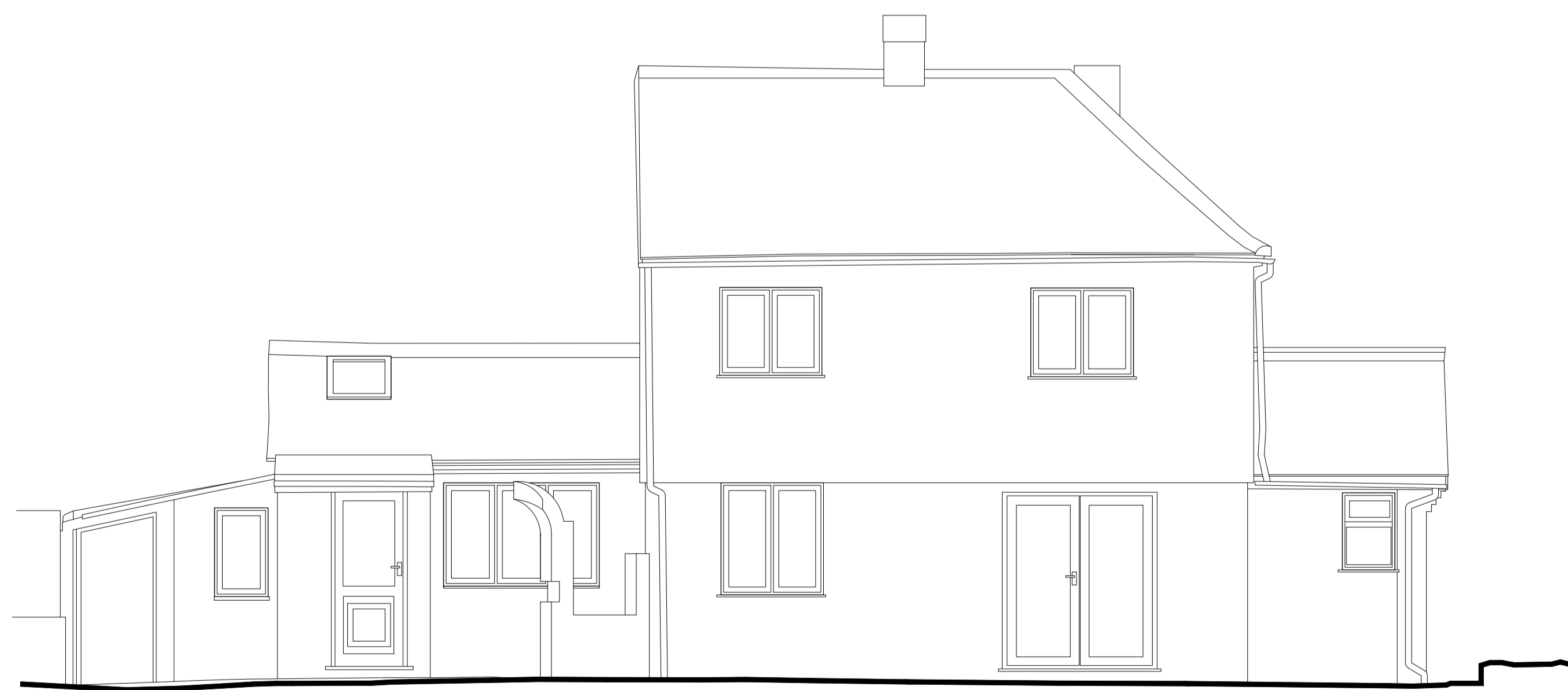
Side (West) Elevation