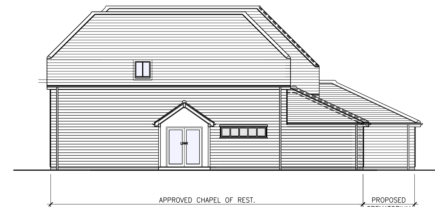
PROPOSED SECTIONAL SIDE ELEVATION SCALE 1:100

EXTERNAL WALLS :- MALDON ANTIQUE RED FACING BRICKWORK EXTERNAL BRICK PLINTH TO PERIMETER WITH NATURAL OAK WEATHERBOARDING TO THE WALLS ABOVE, WITH A NATURAL OAK PENTICE BOARD TO DOOR & WINDOW HEADS. PROVIDE A NATURAL OAK FINISH TO DORMER CHEEKS (SEE NOTE-6).