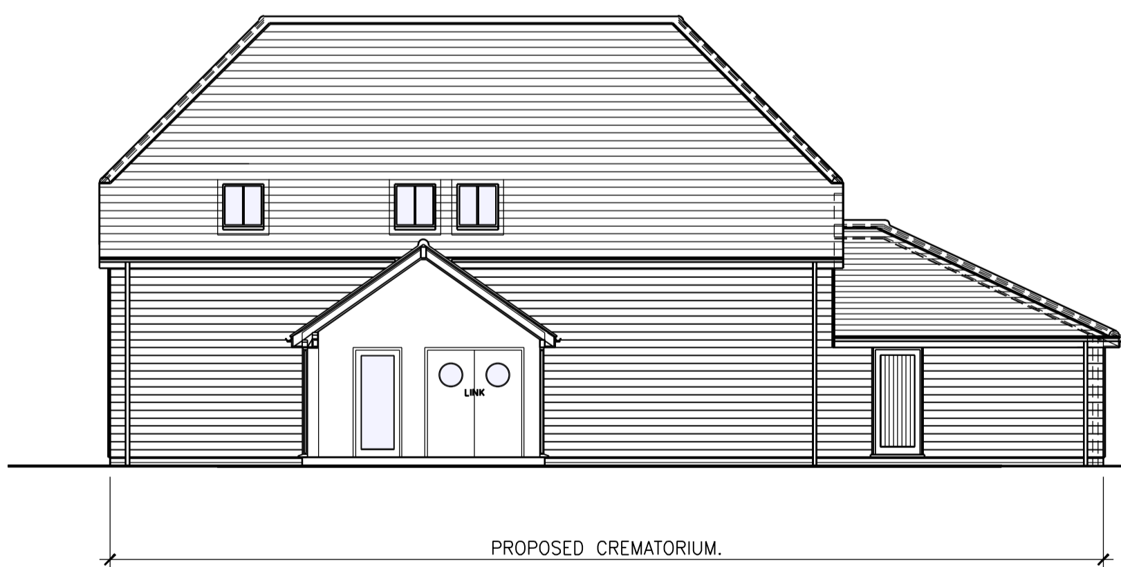
PROPOSED SECTIONAL SIDE ELEVATION SCALE 1:100