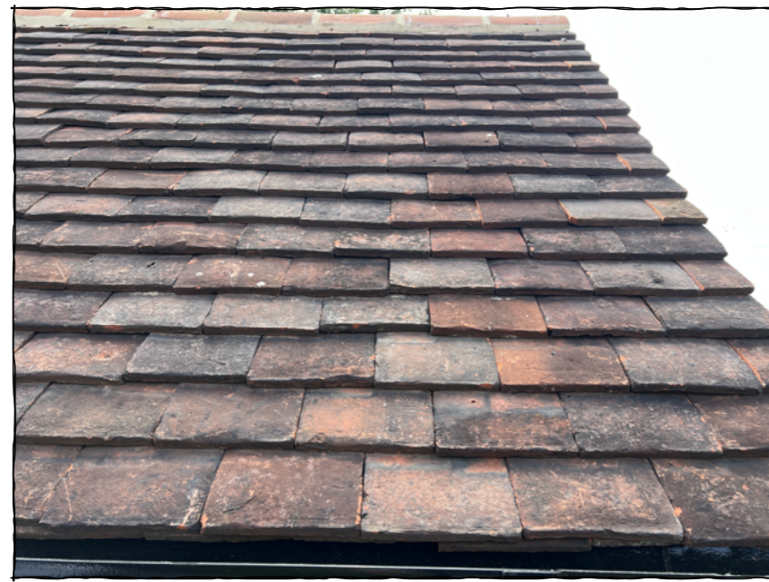
Reclaimed Plain Peg Tiles

THIS DRAWING IS THE PROPERTY OF SIMON BURKE DESIGN LTD AND MAY NOT BE REPRODUCED OR DISCLOSED TO A THIRD PARTY IN ANY FORM WITHOUT WRITTEN PERMISSION.