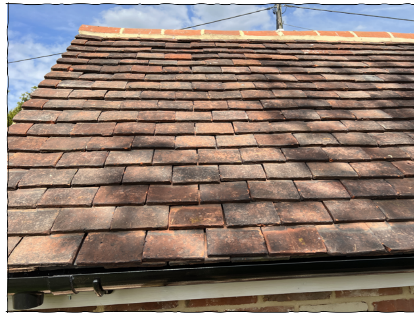
Reclaimed Plain Peg Tiles