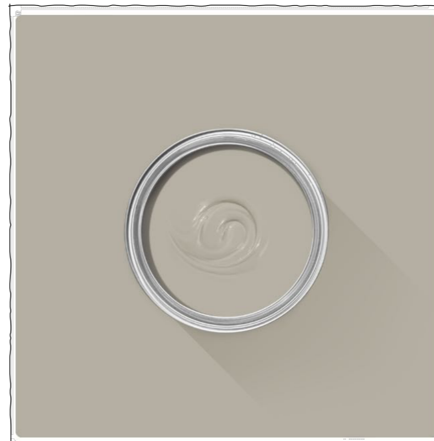
Painted Timber Boarding - Hardwick White No. 5