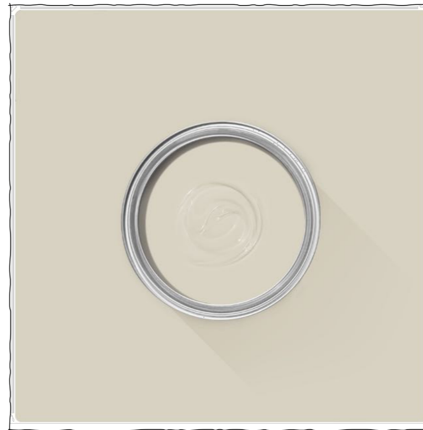
Joinery - Shaded White No. 201