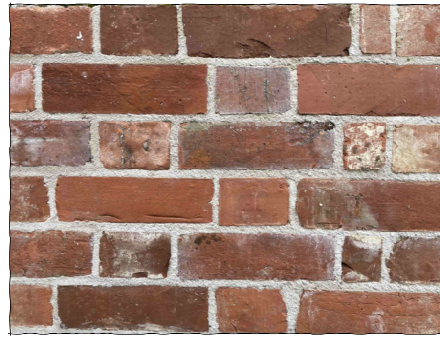
Reclaimed Brick for Front Boundary Wall (sample panel to be constructed on site for inspection)