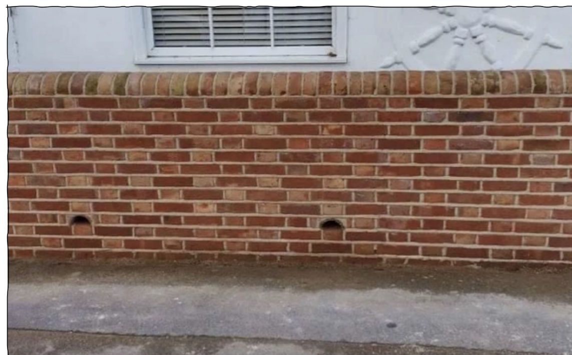
Plinth Walls - Britannia Handmade Red Brick