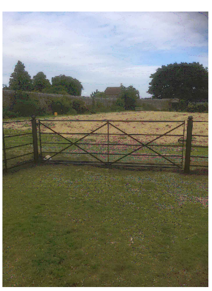
Example Black Metal Gate