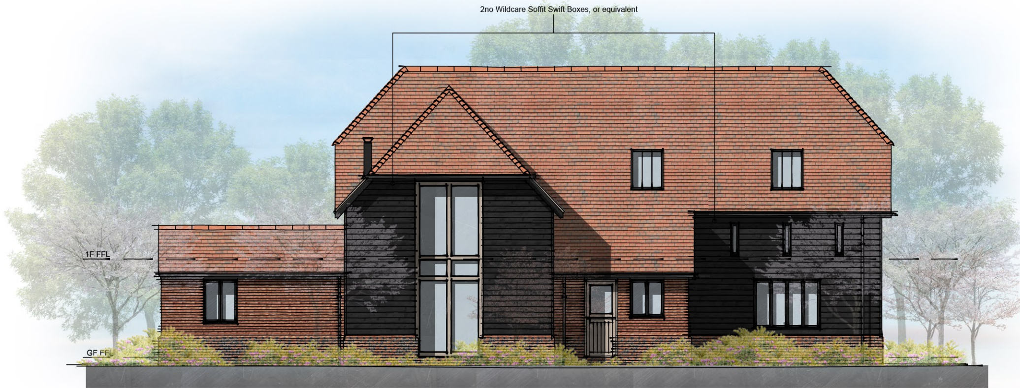
NORTH ELEVATION (proposed) - scale 1/100