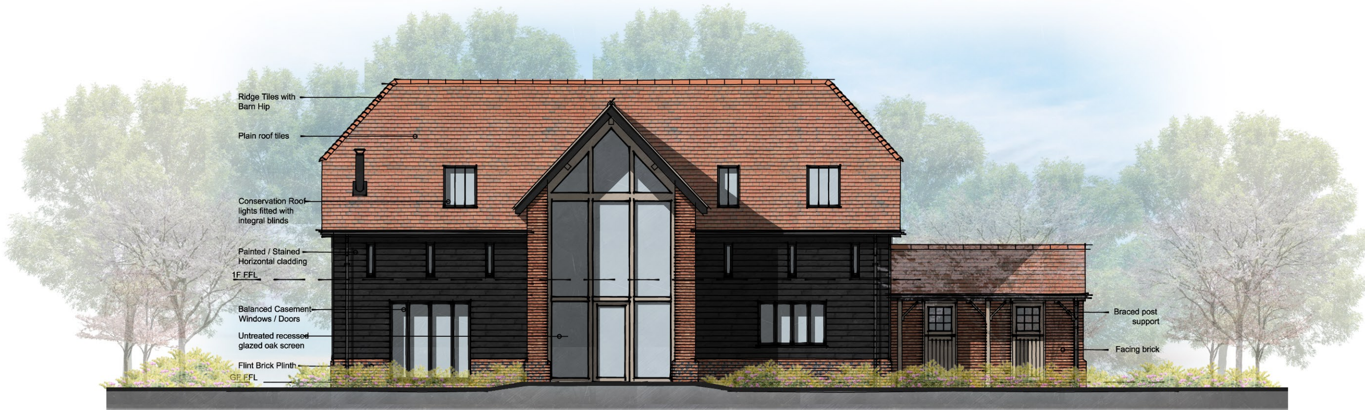
SOUTH ELEVATION (proposed) - scale 1/100