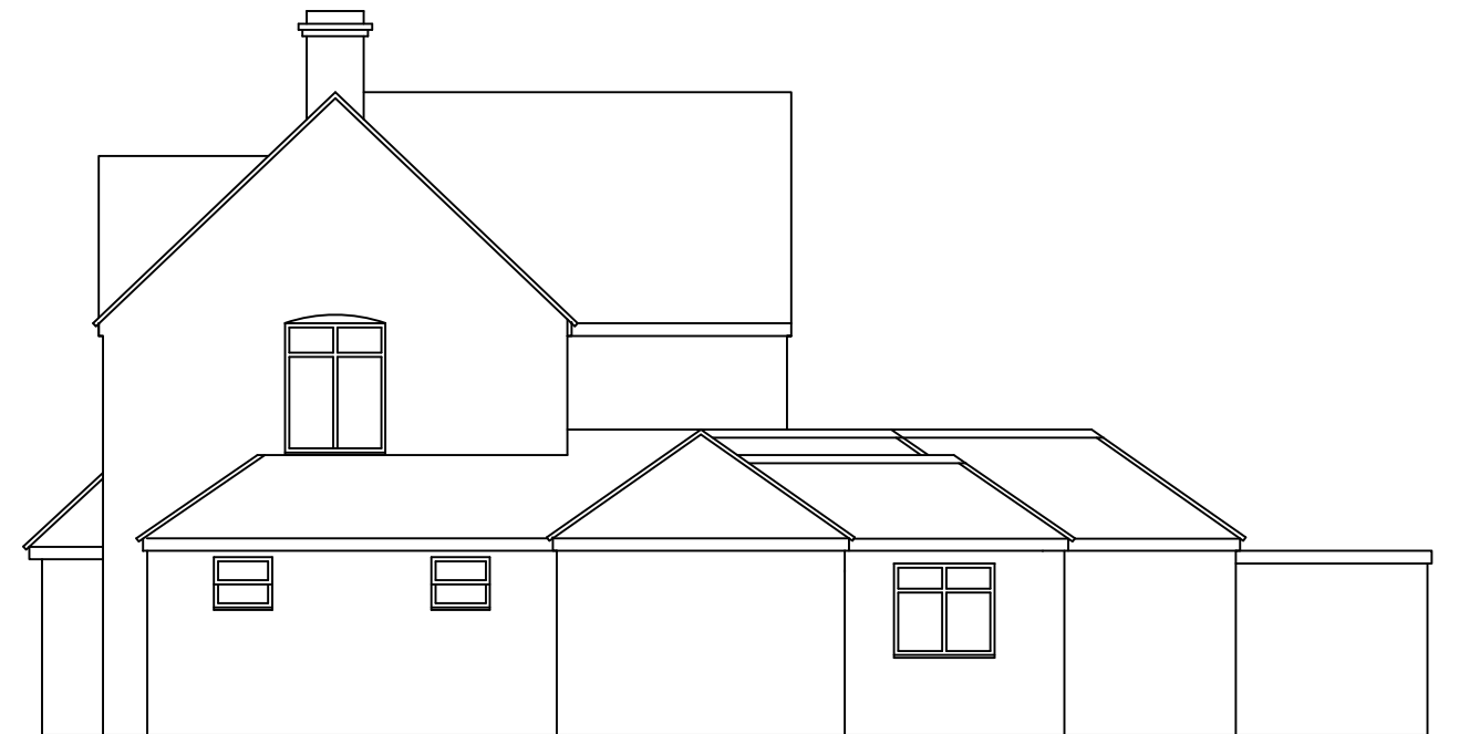
Proposed Side (western) Elevation