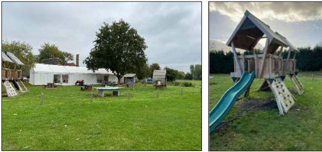
Children's play equipment