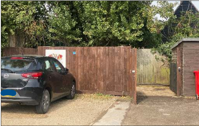
Fence around the bins

largely timber construction and sited away from the building to the rear of the pub garden. All of the other structures are sited along the north boundary of the site, away from the building. The shipping containers are screened by timber fencing to improve their appearance within the setting of the listed building.