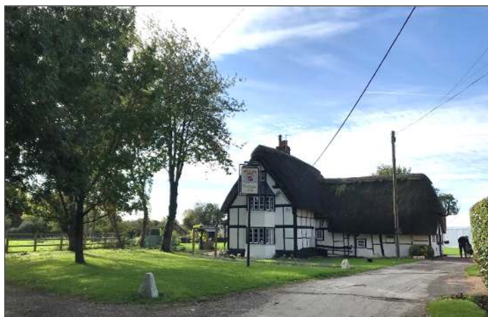
Existing view of the property