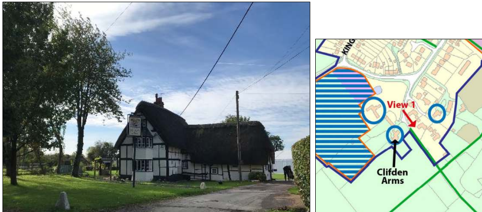
View approaching the site from the north (Clifden Road) and Policy CH1 extract, red arrow is the protected view.