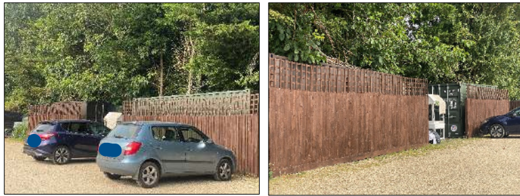
Temporary shipping containers