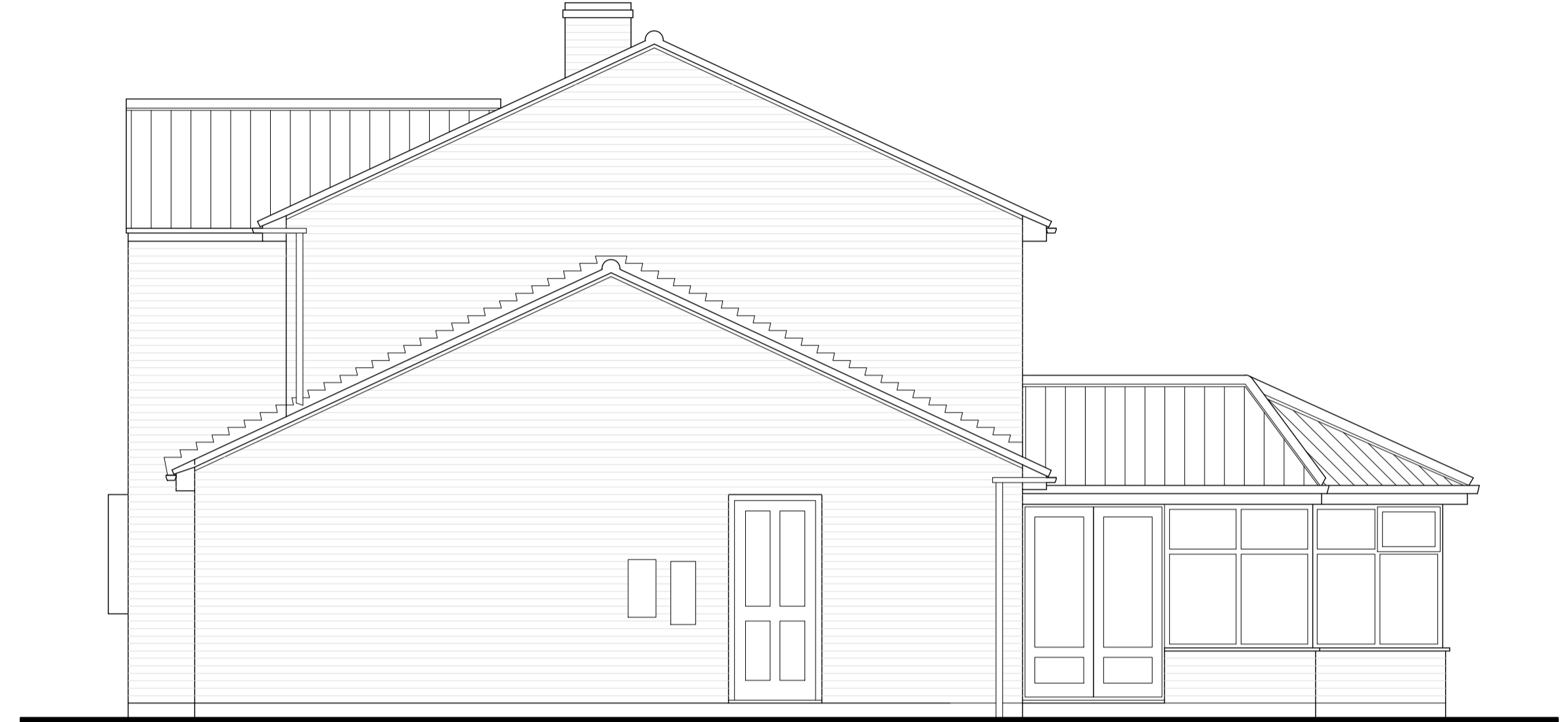
NORTH EAST ELEVATION AS EXISTING