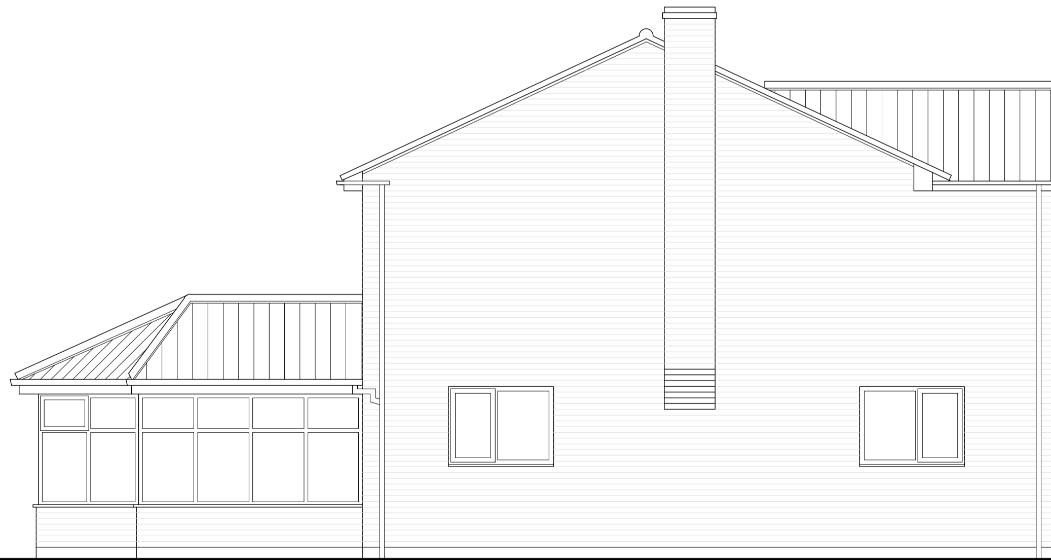
SOUTH WEST ELEVATION AS EXISTING