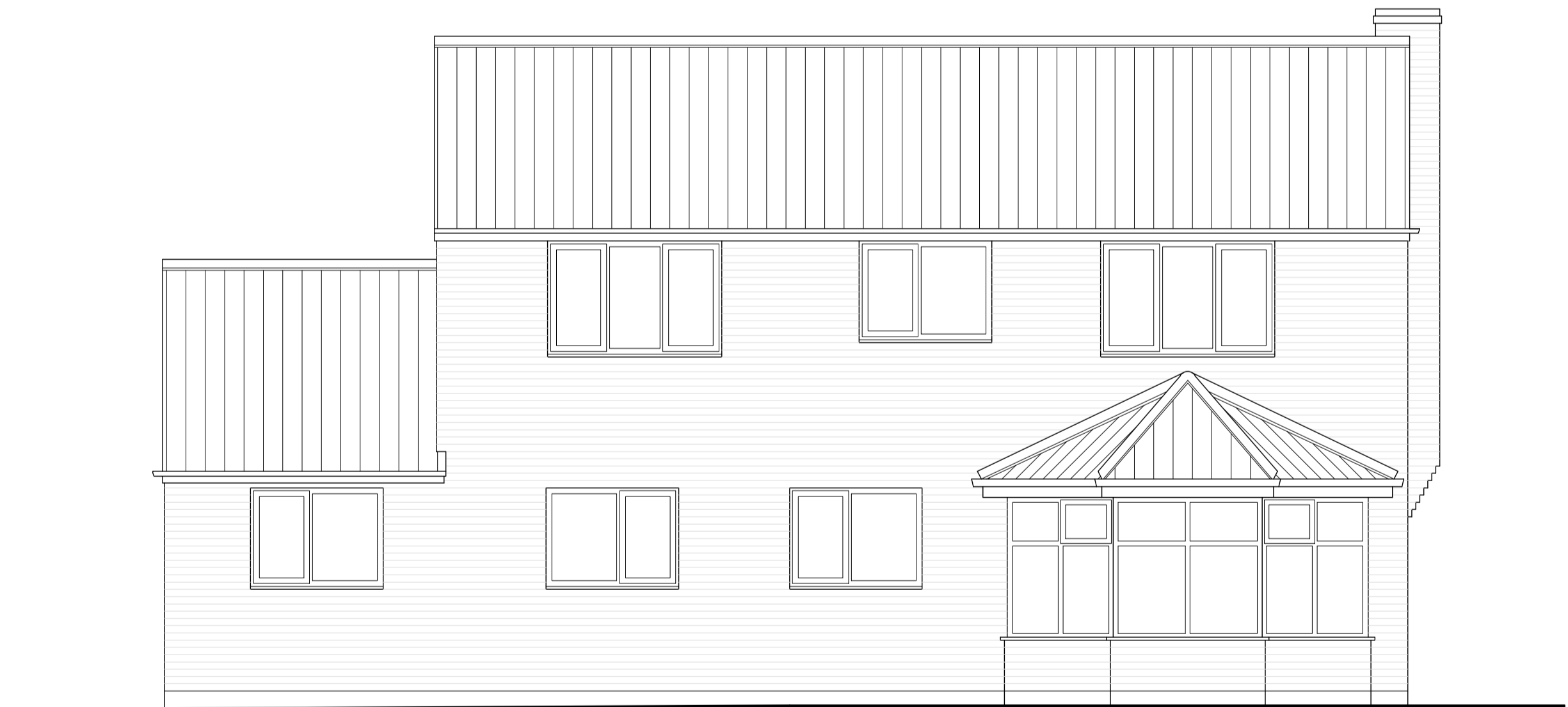
NORTH WEST ELEVATION AS EXISTING

ANDREW BRAMLEY ASSOCIATES Architectural Designers