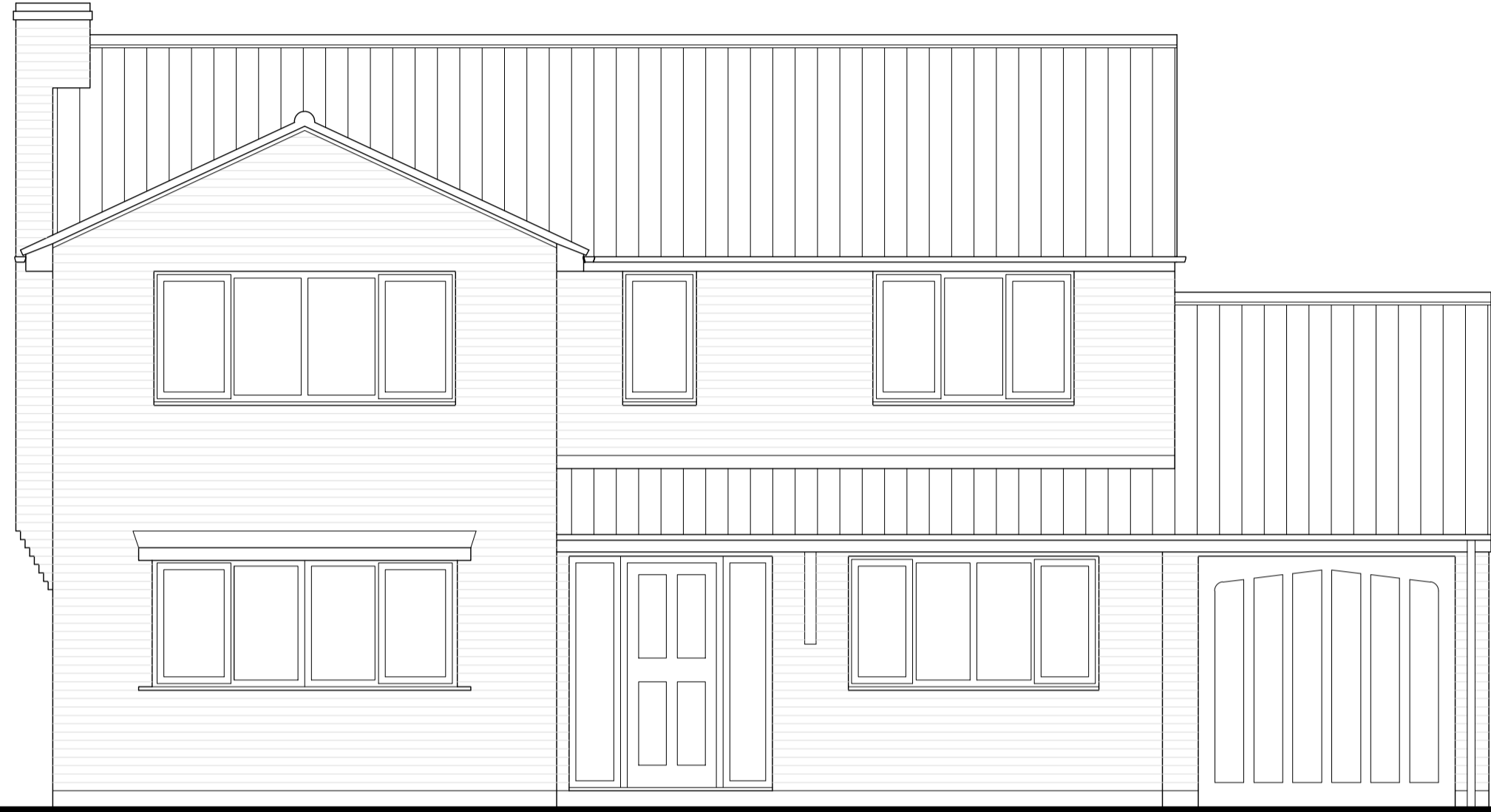
SOUTH EAST ELEVATION AS EXISTING