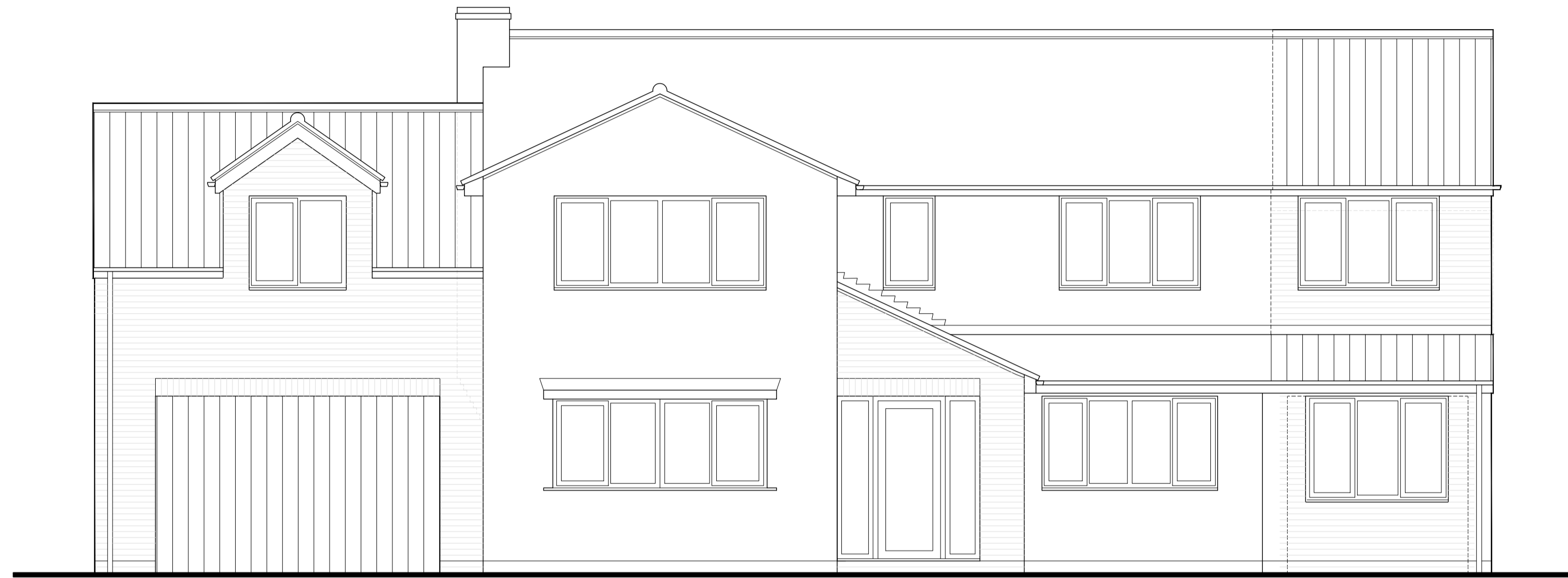
SOUTH EAST ELEVATION AS PROPOSED