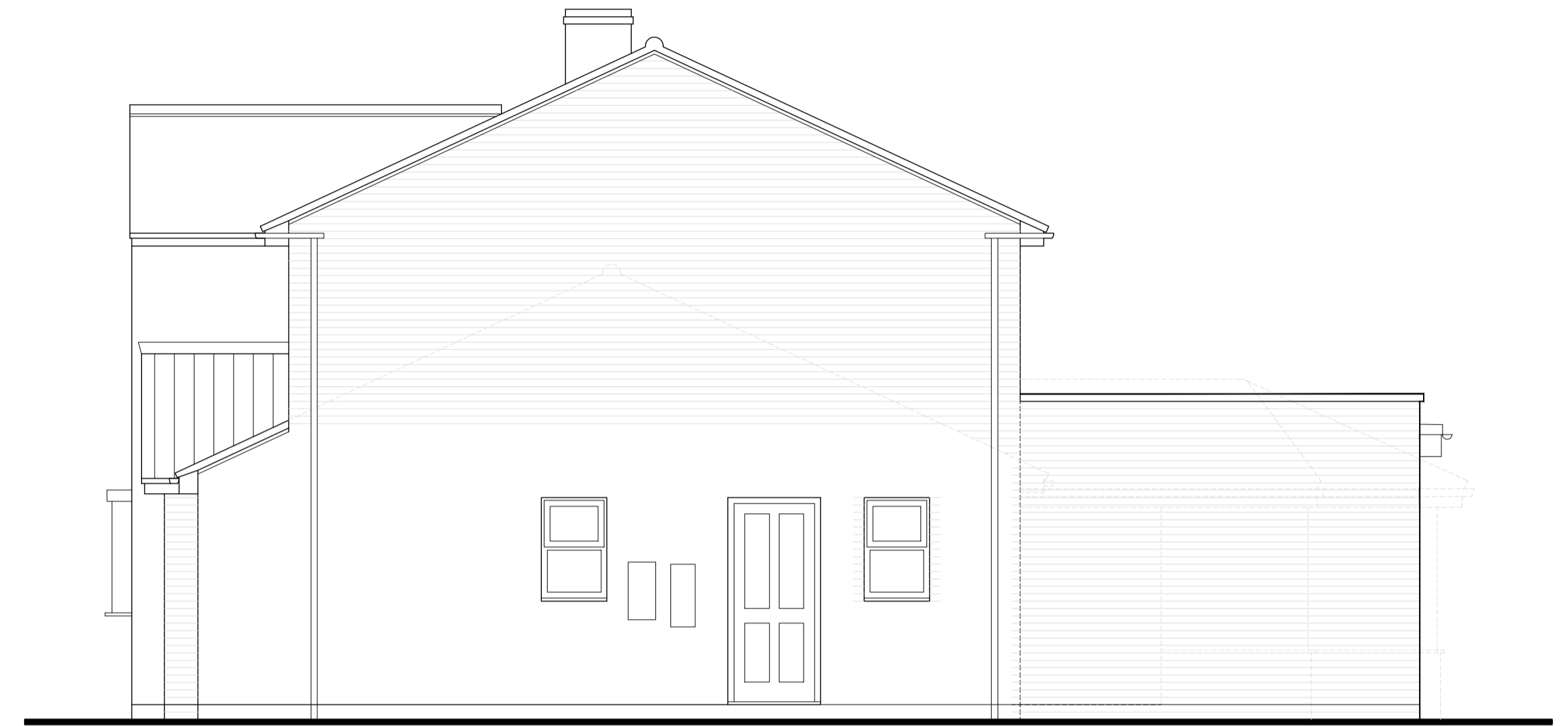
NORTH EAST ELEVATION AS PROPOSED