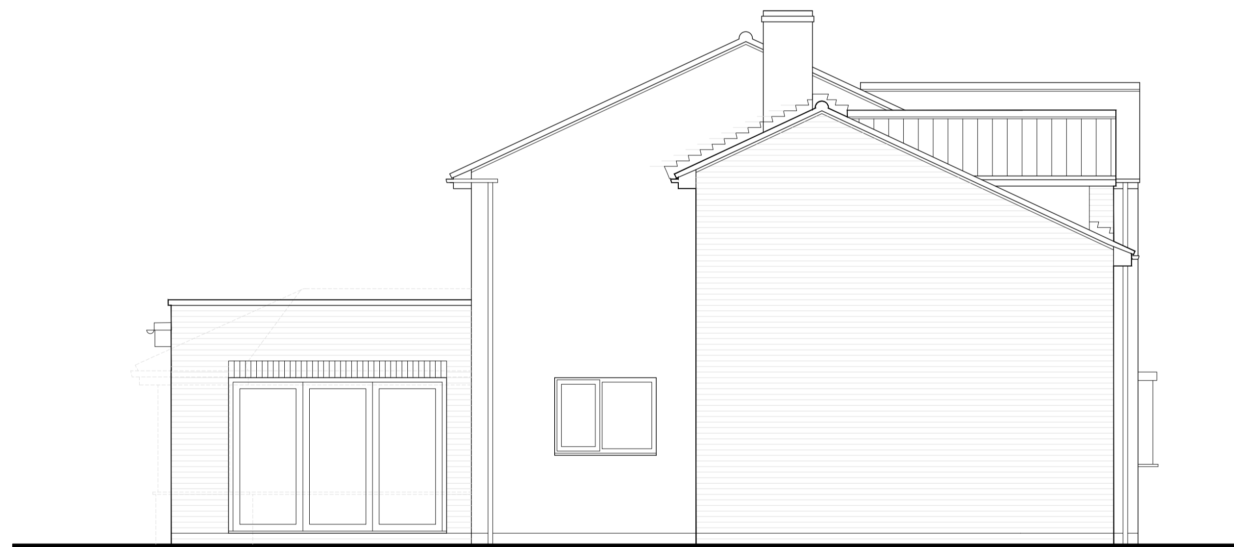
SOUTH WEST ELEVATION AS PROPOSED