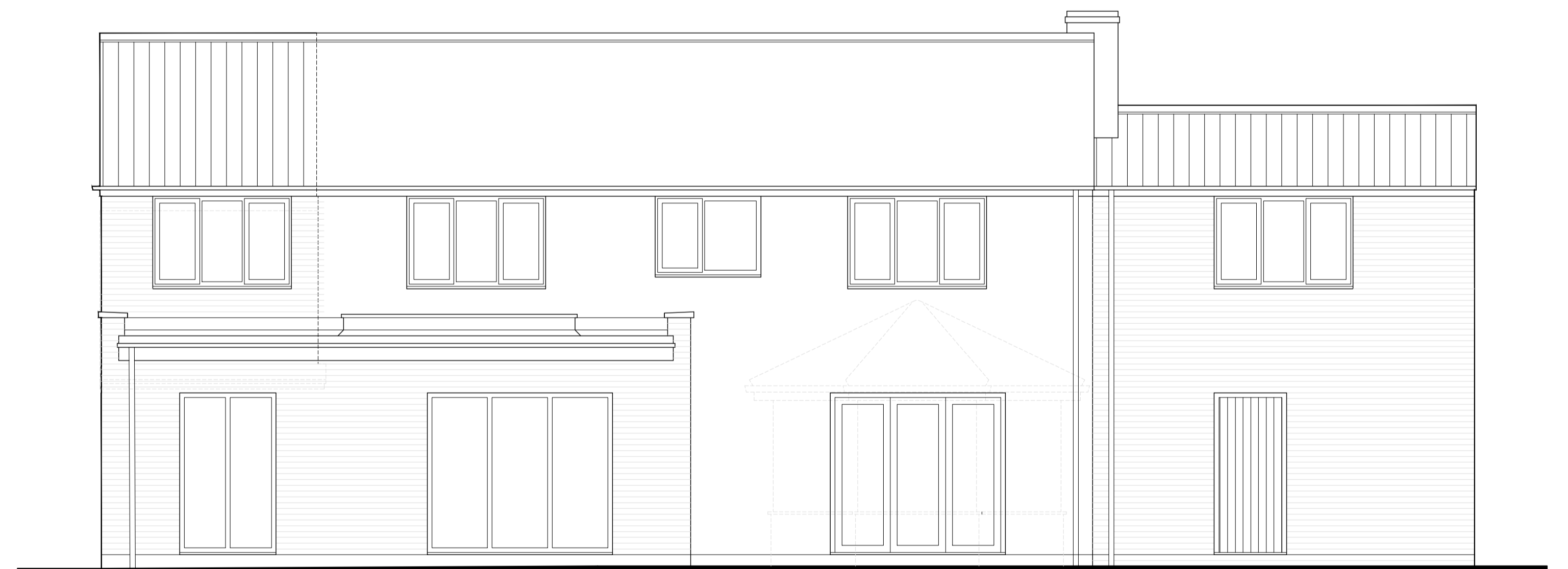
NORTH WEST ELEVATION AS PROPOSED

ANDREW BRAMLEY ASSOCIATES Architectural Designers