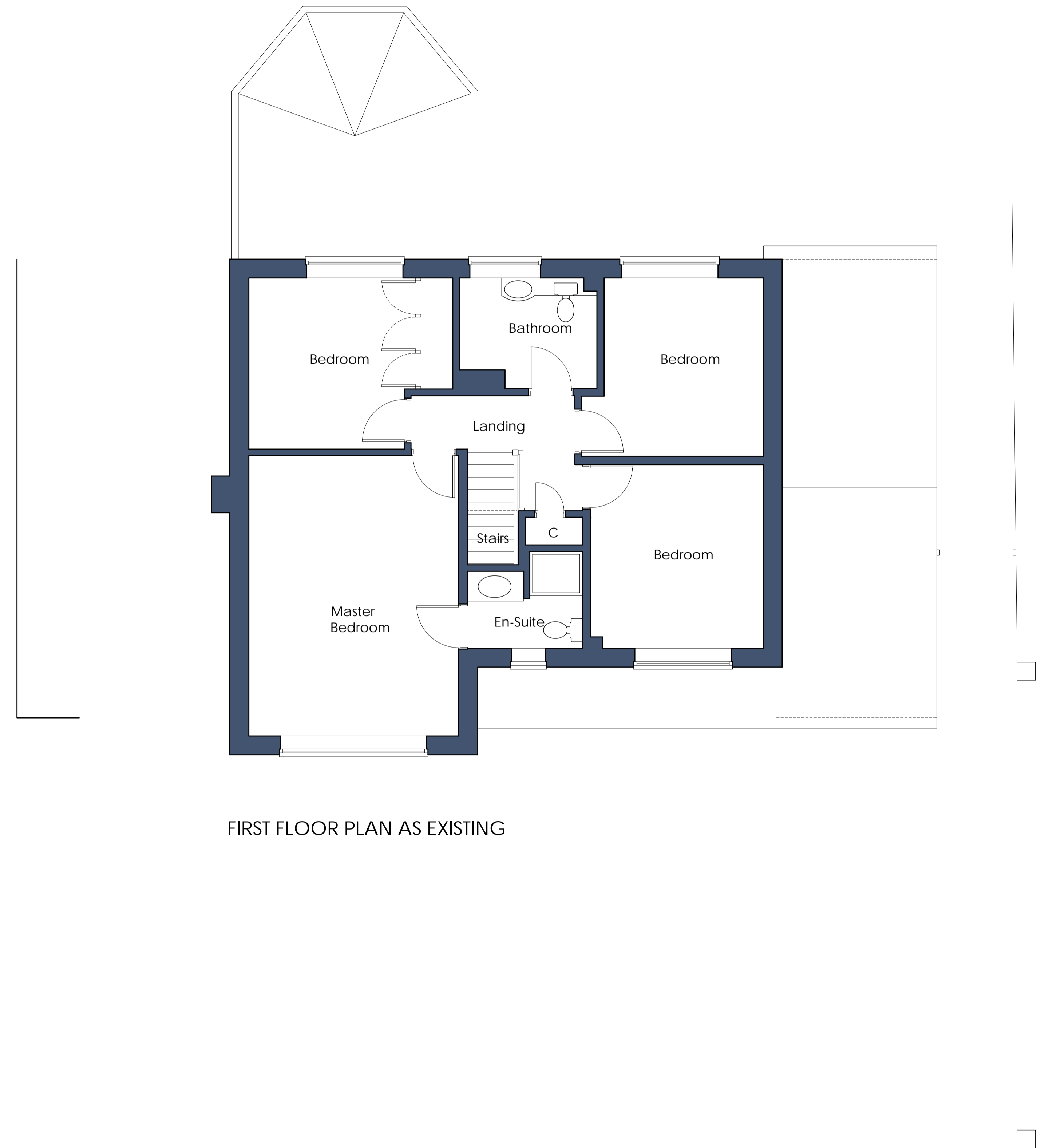
FIRST FLOOR PLAN AS EXISTING

ANDREW BRAMLEY ASSOCIATES Architectural Designers