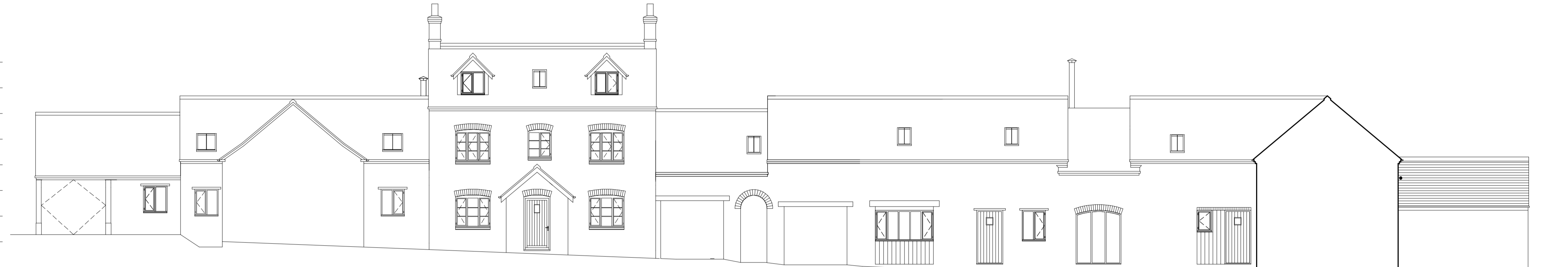
PROPOSED SOUTH-EAST INTERNAL COURTYARD ELEVATION

117.000 116.000 115.000 114.000 113.000 112.000 111.000 110.000 109.000 108.000