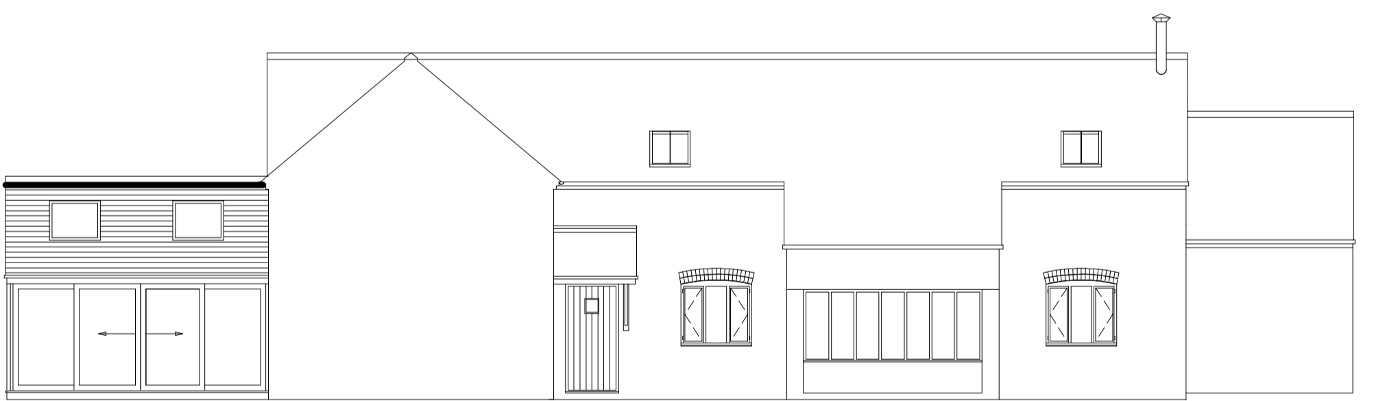
PROPOSED NORTH-WEST INTERNAL COURTYARD ELEVATION

117.000 116.000 115.000 114.000 113.000 112.000 111.000 110.000 109.000 108.000