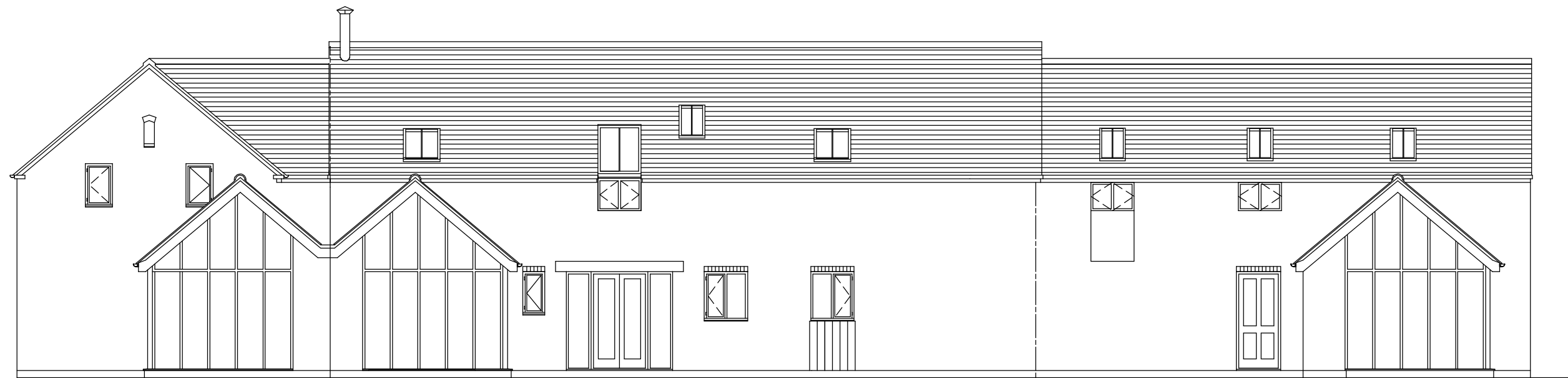
PROPOSED NORTH-EAST EXTERNAL ELEVATION

117.000 116.000 115.000 114.000 113.000 112.000 111.000 110.000 109.000 108.000