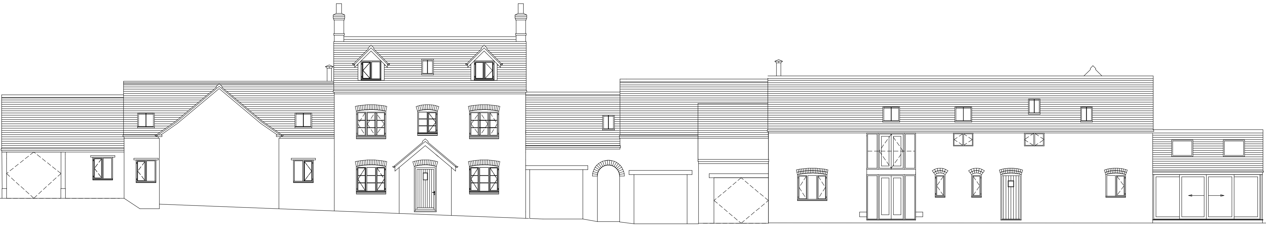
PROPOSED SOUTH-EAST EXTERNAL ELEVATION

117.000 116.000 115.000 114.000 113.000 112.000 111.000 110.000 109.000 108.000