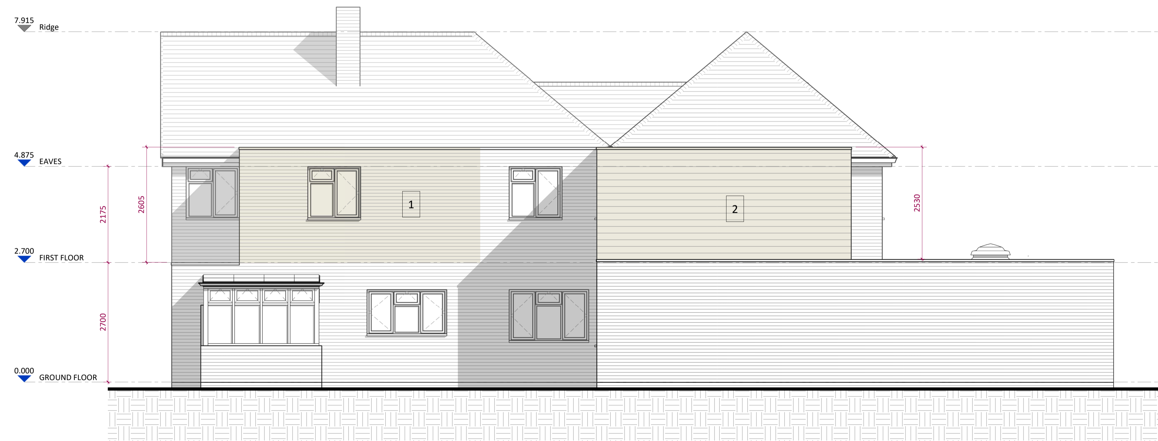
2 EAST - ELEVATION-COMPLETE 1 : 50