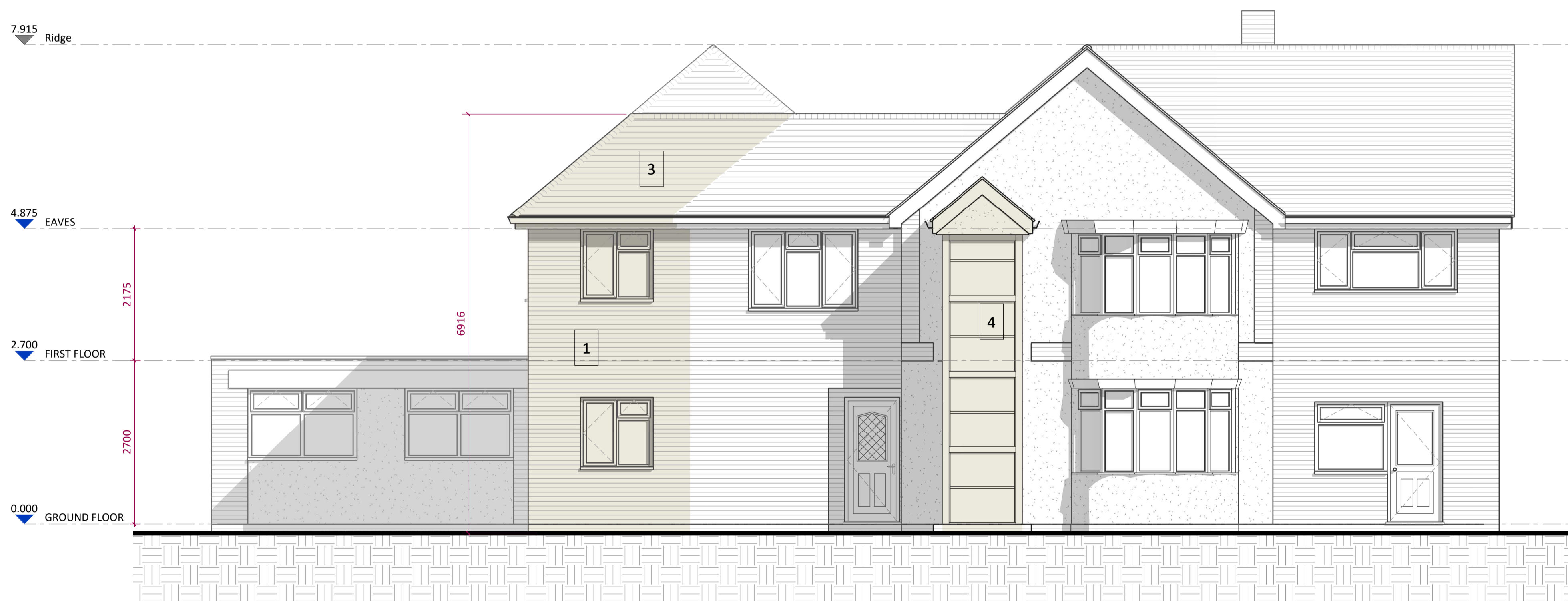
2 WEST - ELEVATION - COMPLETE 1 : 50