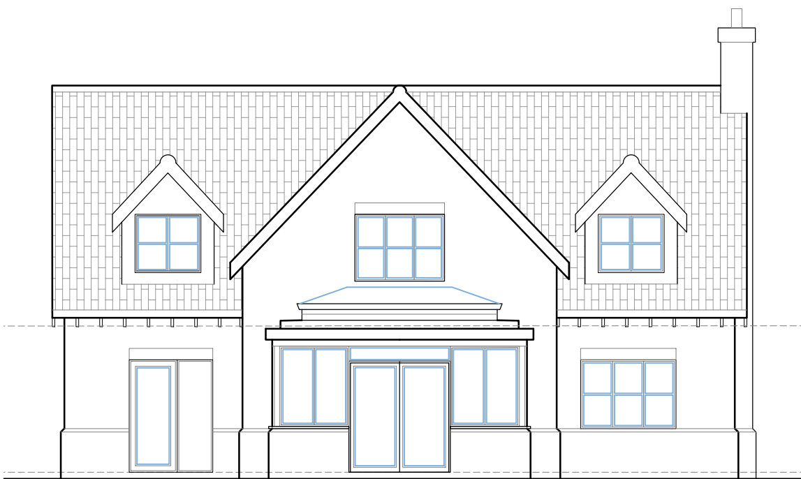
Rear Elevation scale 1:100 @ A3