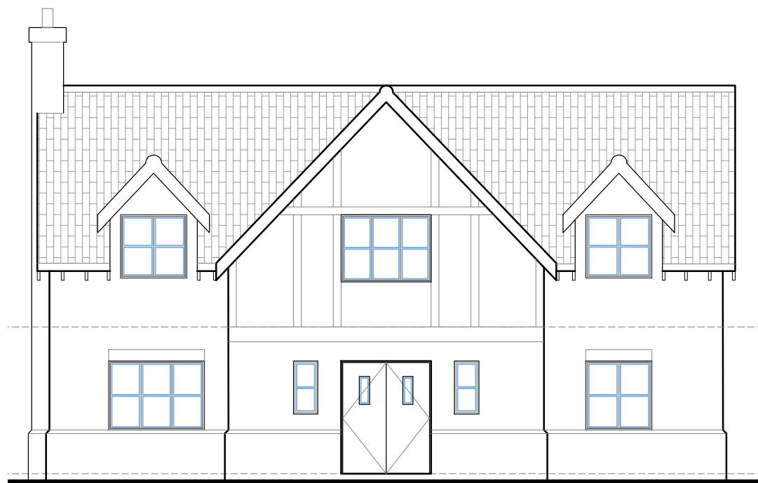
Front Elevation scale 1:100 @ A3