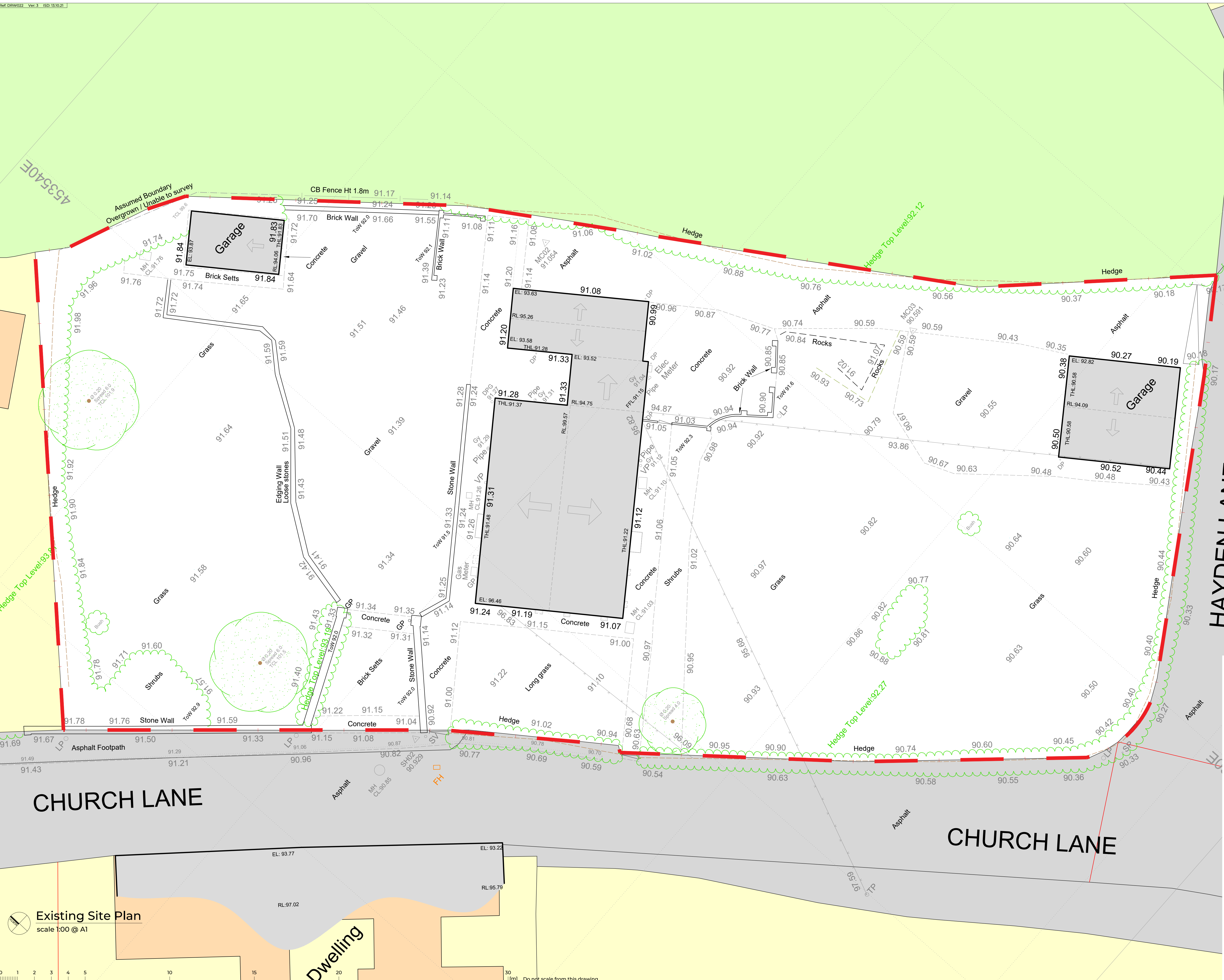
Existing Site Plan scale 1:00 @ A1