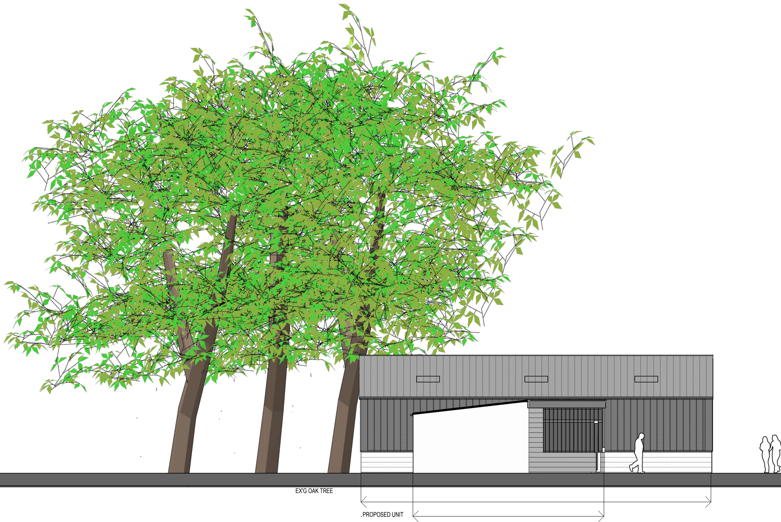
SOUTH WEST ELEVATION (Section through office building)