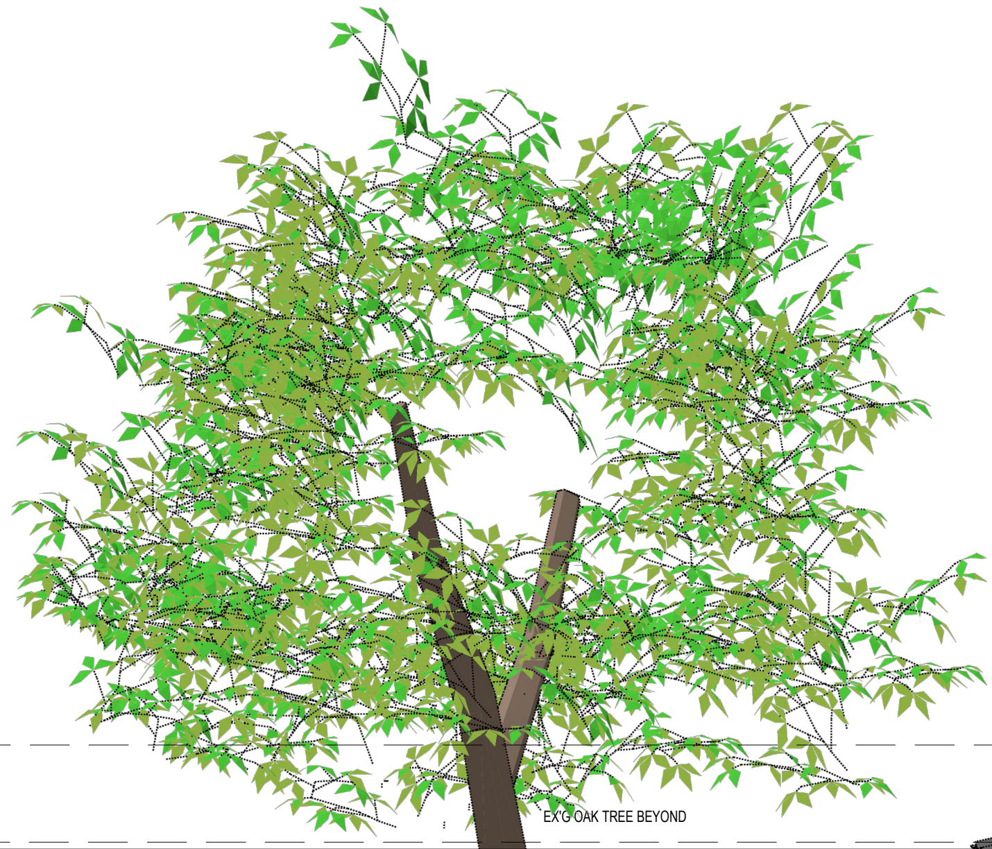
EX'G OAK TREE BEYOND

PROPOSED ROOF RIDGE AND EAVES HTS TO MATCH EXISTING