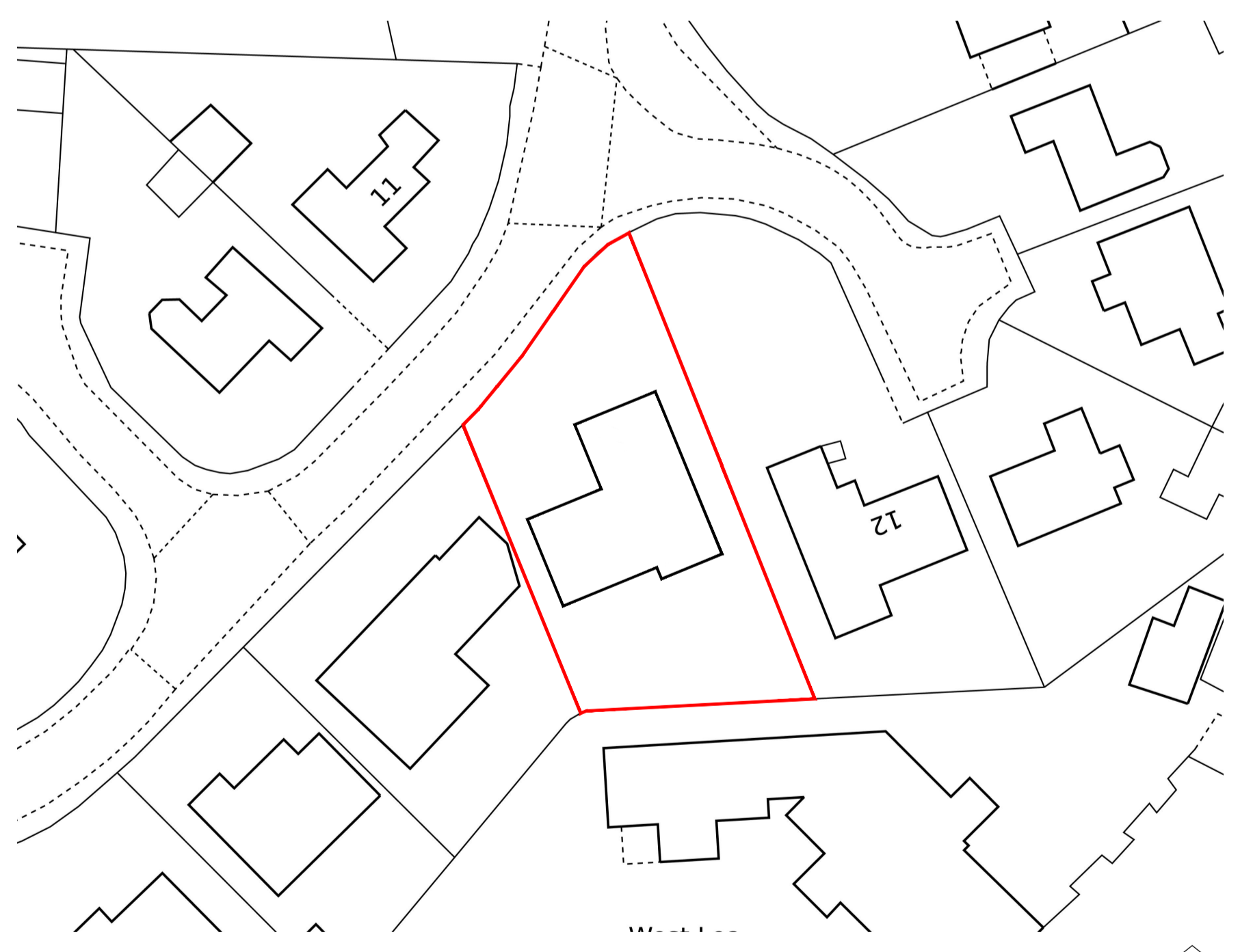
Existing Block Plan SCALE 1:500 0 12.5 25 50