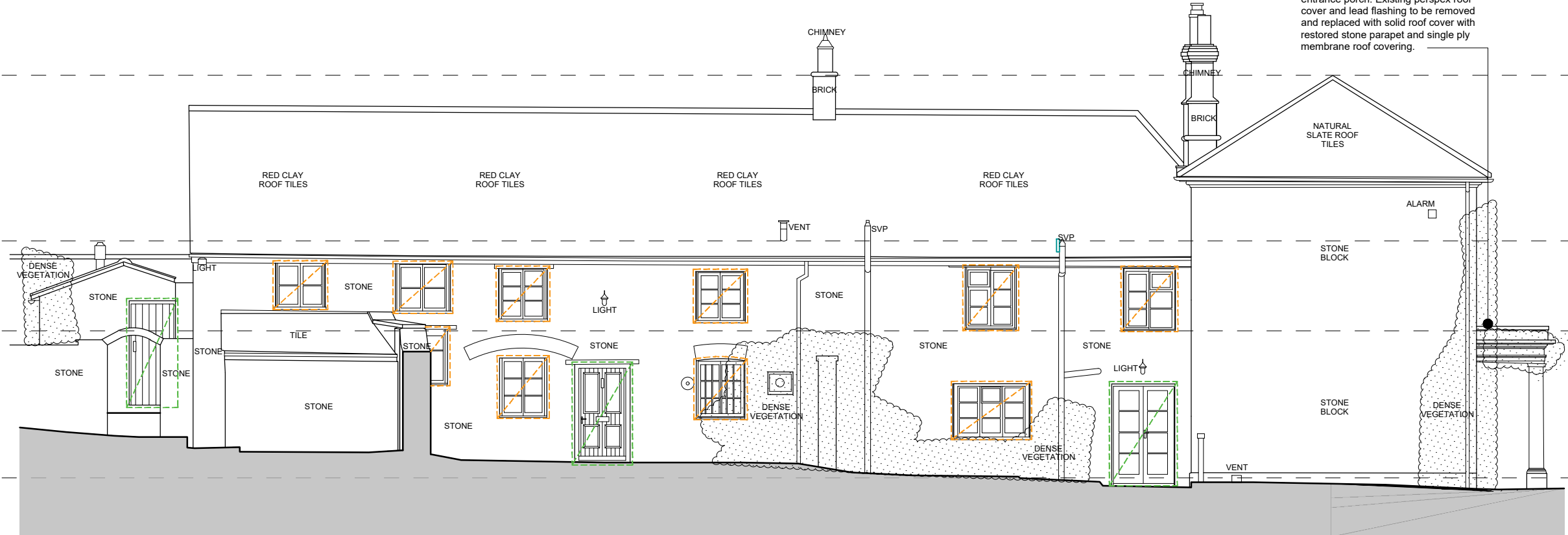
SIDE (NORTH-WEST) ELEVATION AS PROPOSED