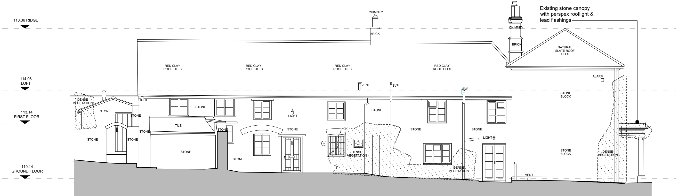
SIDE (NORTH-WEST) ELEVATION AS EXISTING