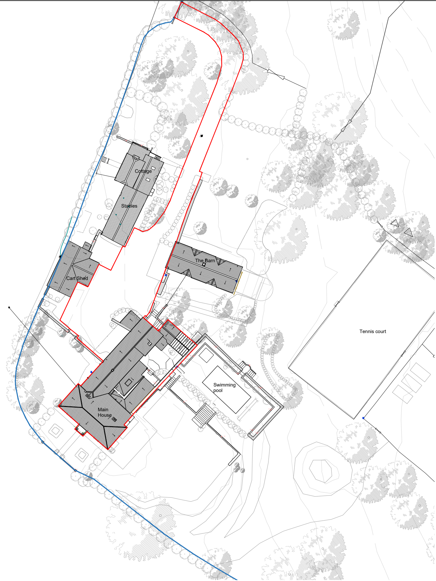
SITE MASTERPLAN - 1:500