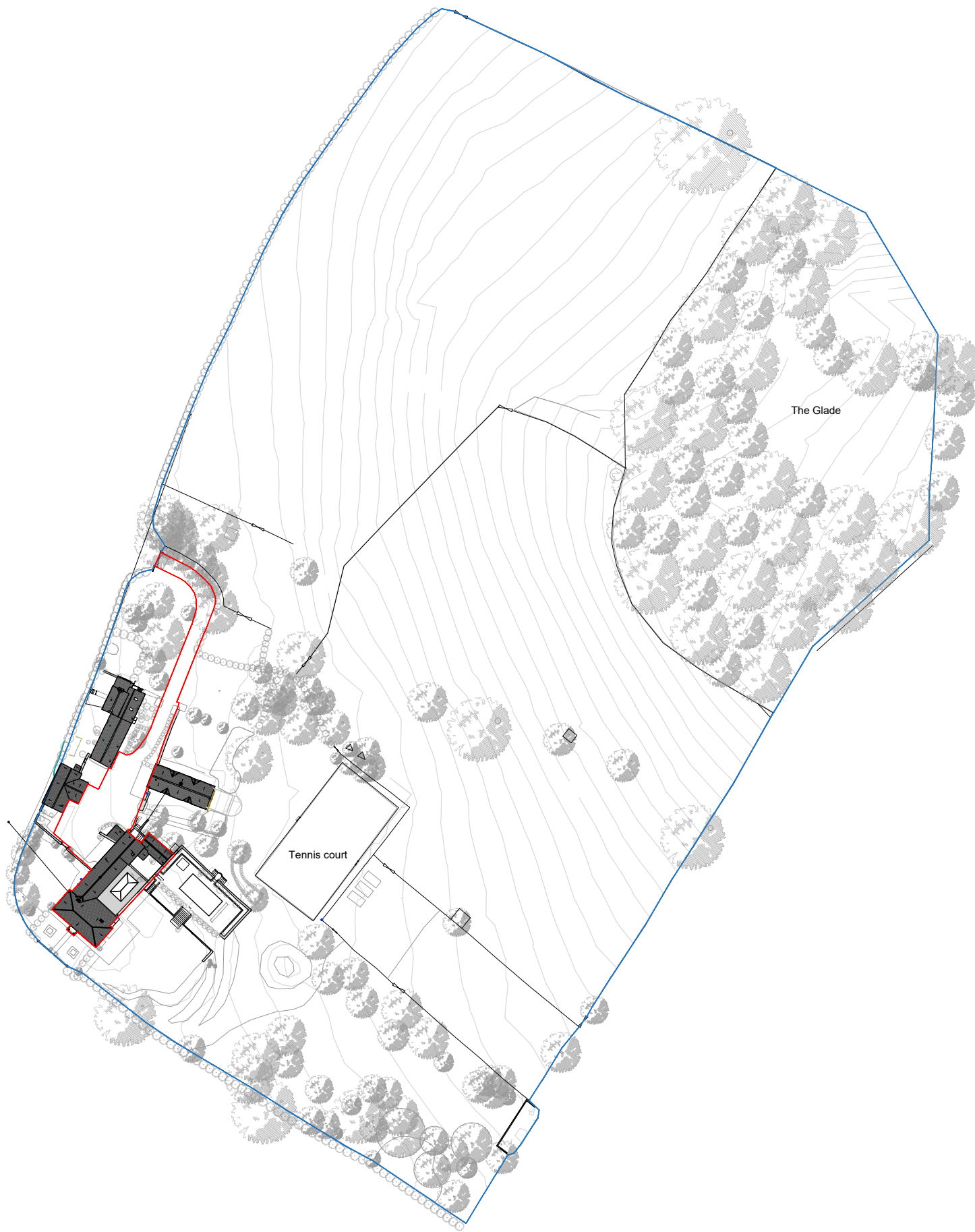
FULL SITE EXTENT AS PROPOSED - 1:1250