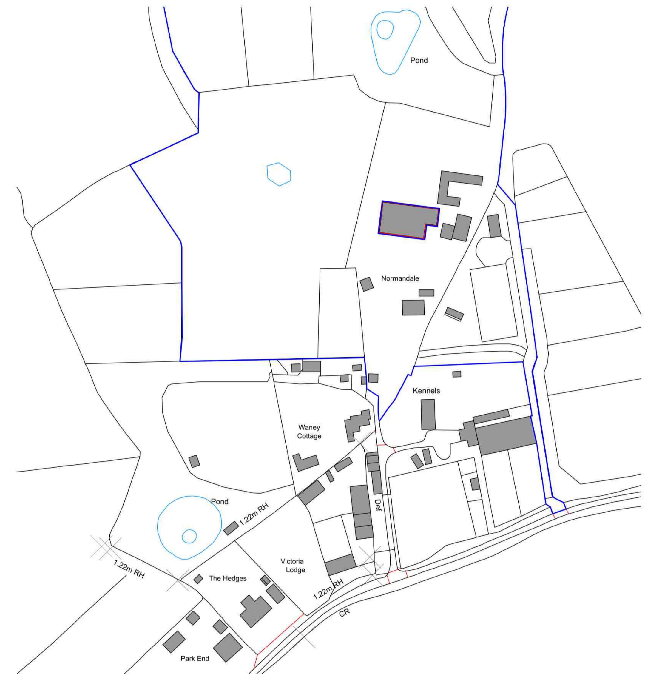
Location Plan scale 1:1250