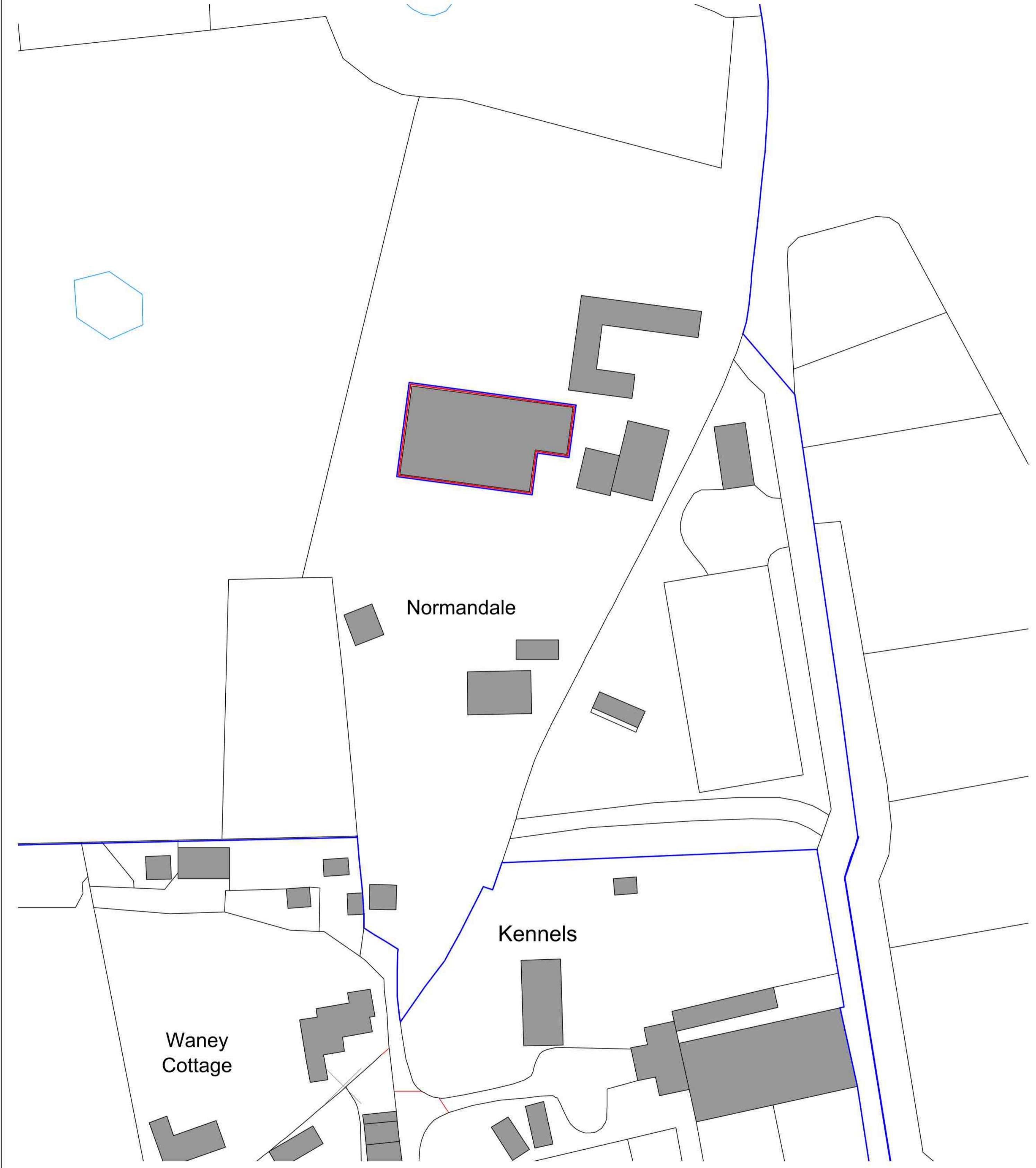
Block Plan scale 1:500