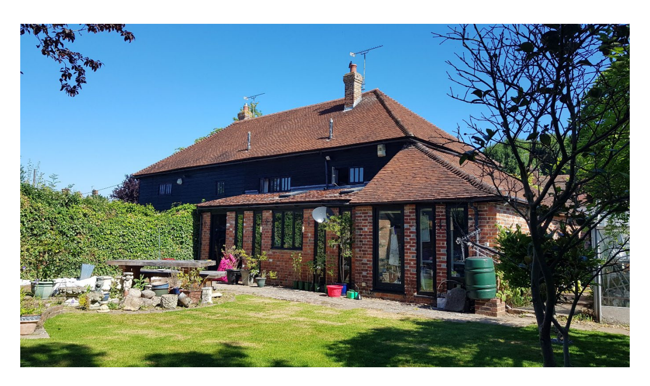
Exterior photograph showing existing rear of property