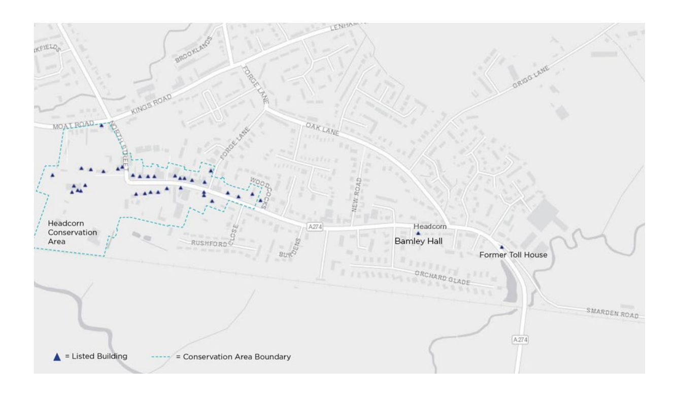
Surrounding Listed Buildings & Bramley Hall's Relationship to the Conservation Area