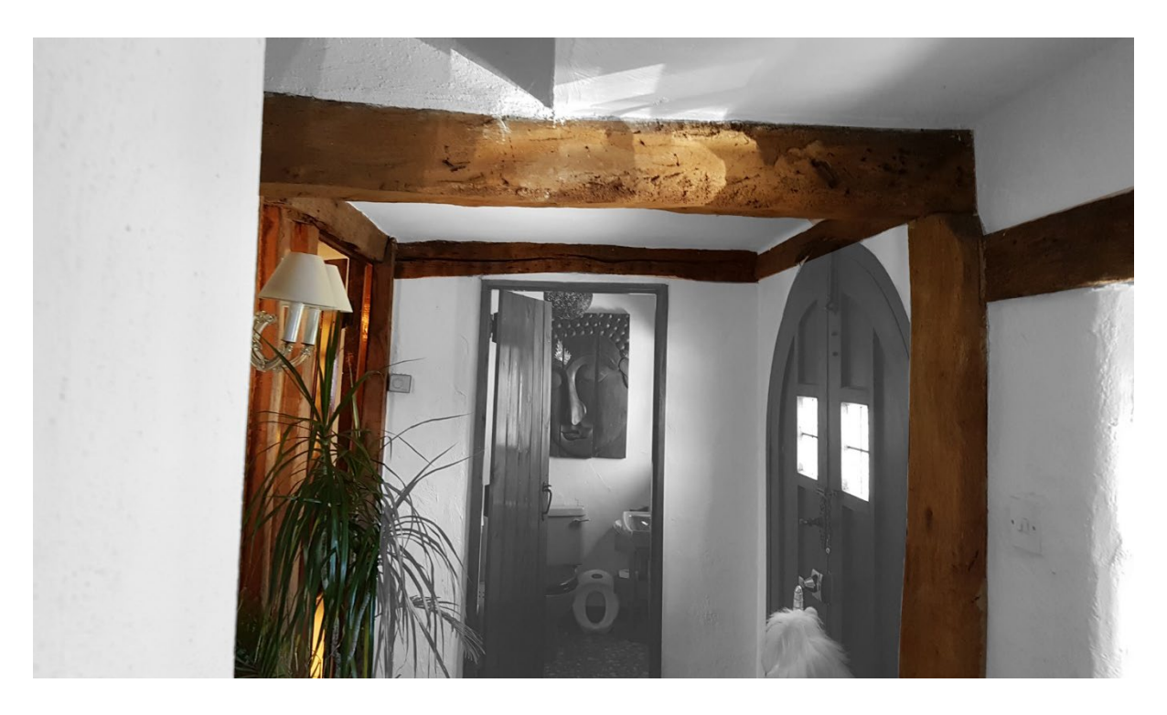
Original Timber Frame Visible Internally

To date there has not been any investigation into archaeological issues on the above site. We would request that if the Maidstone Borough Council feel this is a site that requires addition investigation then the detail of this can be agreed as a condition to any consent prior to any work starting on site.