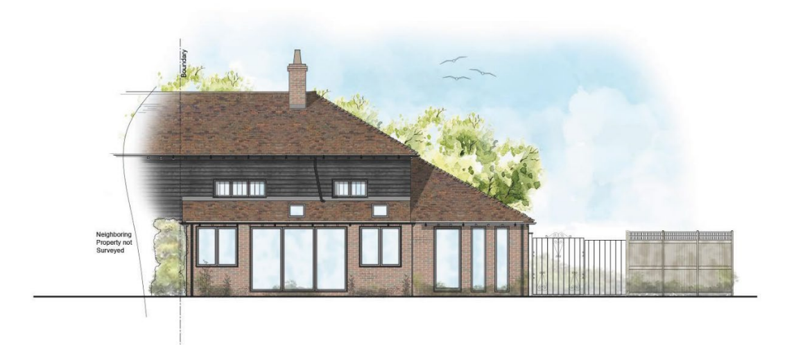
{\it Proposed Rear Elevation showing minimal alterations to the existing facade.}