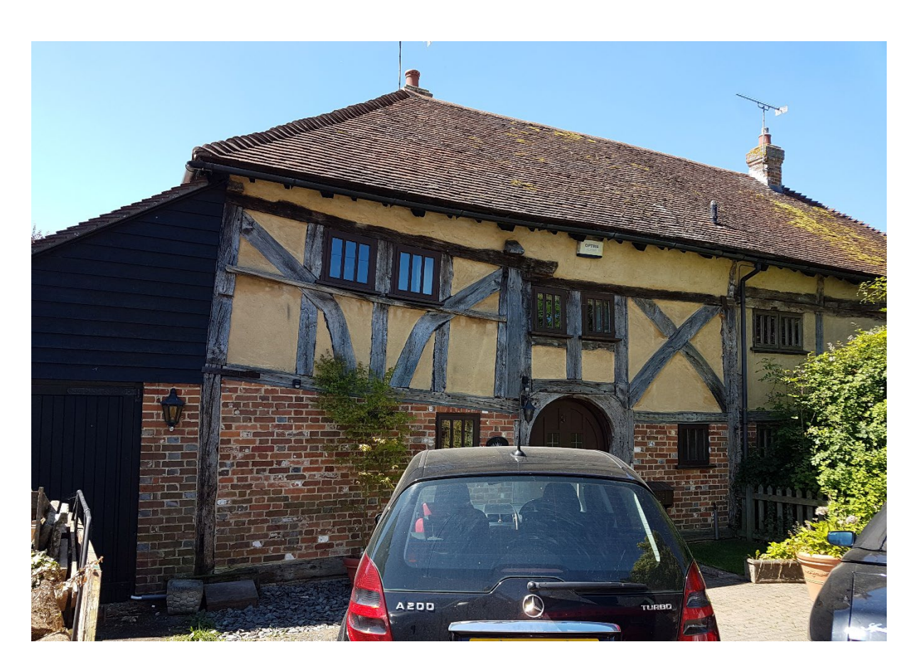
Photograph of Bramley Hall, Principle Elevation