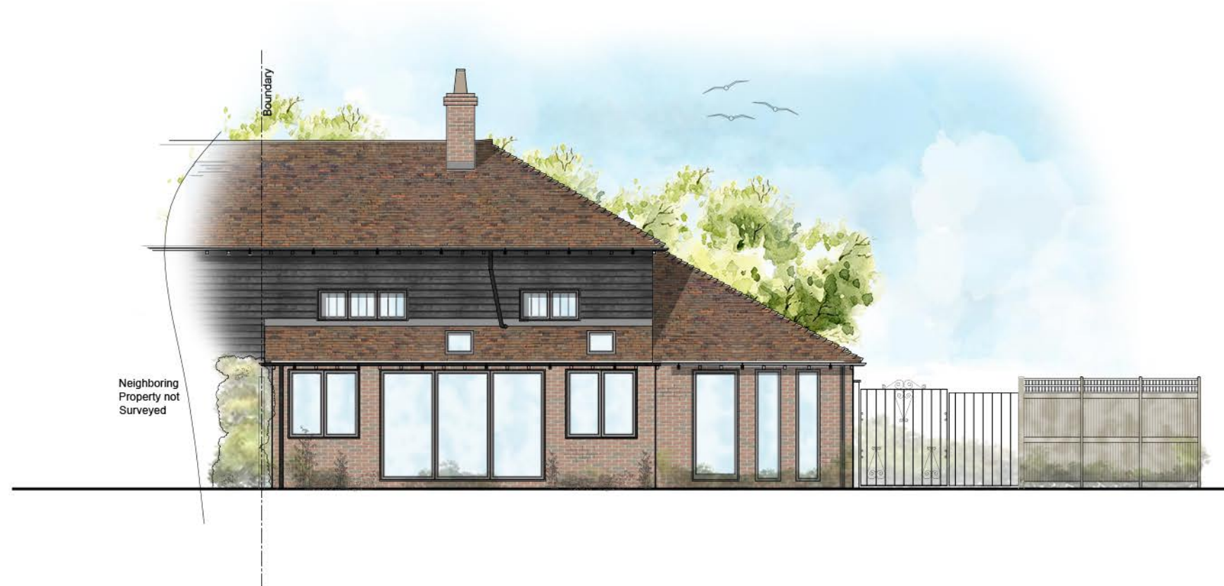
South West Elevation as Proposed 1:100