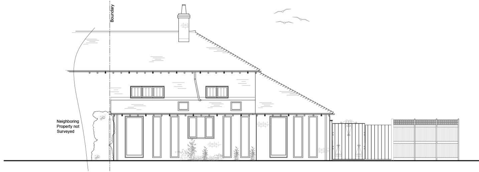
South West Elevation as Existing 1:100