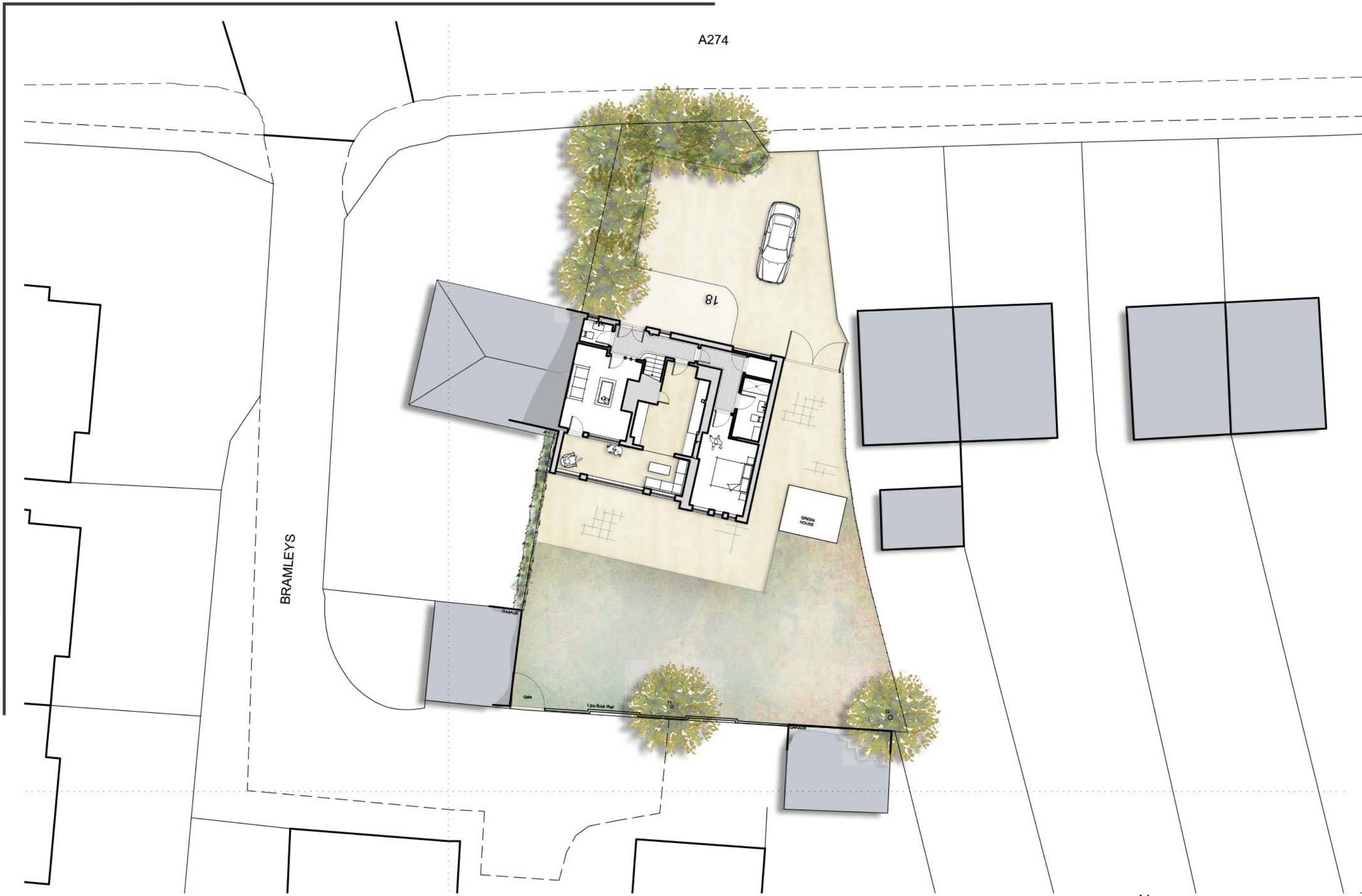
Site Plan as Proposed 1:200