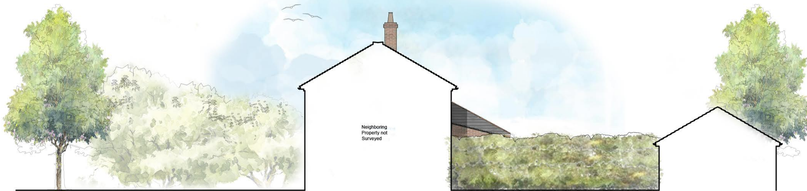
North West Elevation as Proposed 1:100