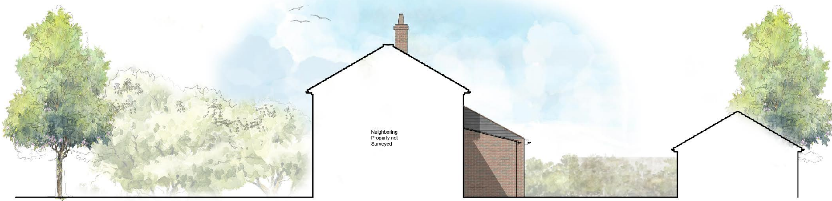
North West Elevation as Proposed 1:100